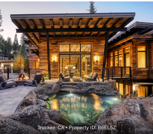
Truckee, CA • Property ID: B6EL5Z