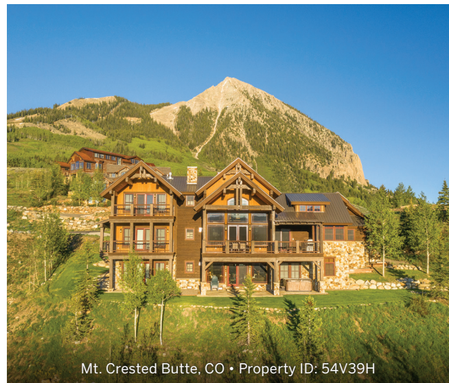
Mt. Crested Butte, CO • Property ID: 54V39H