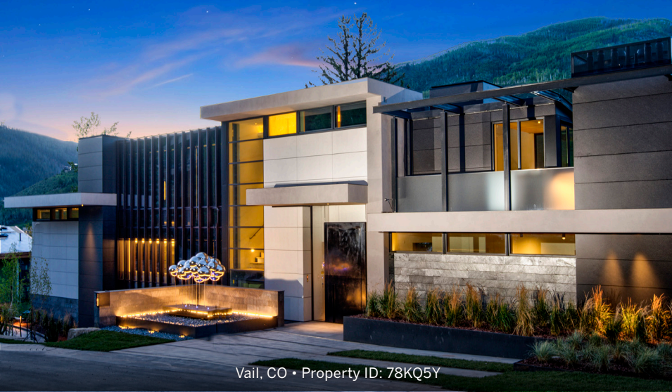
Vail, CO • Property ID: 78KQ5Y