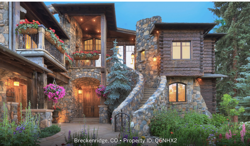
Breckenridge, CO • Property ID: Q6NHX2