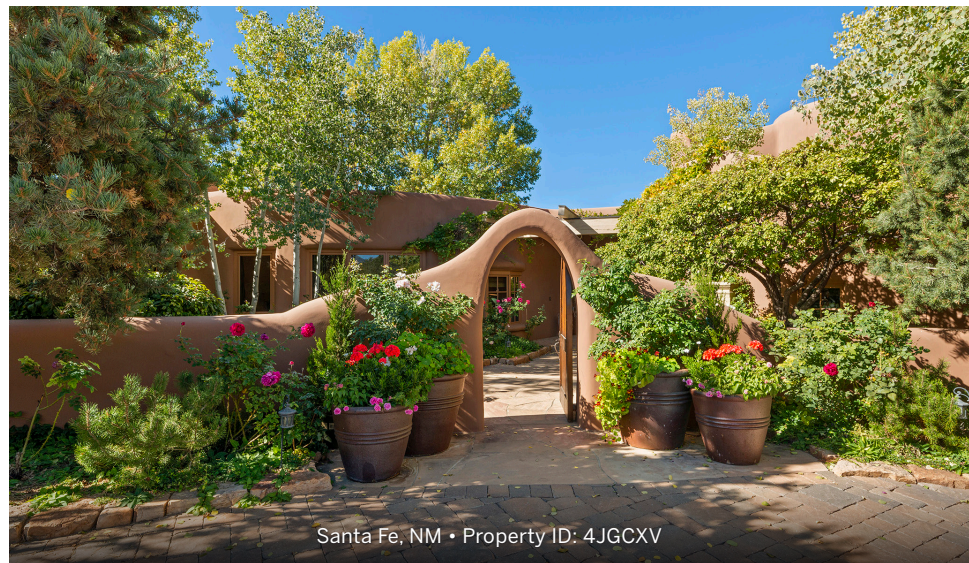
Santa Fe, NM • Property ID: 4JGCXV