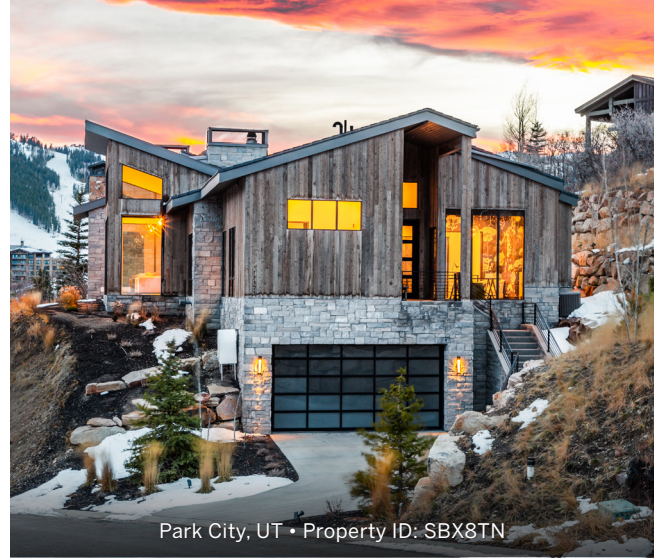
Park City, UT • Property ID: SBX8TN