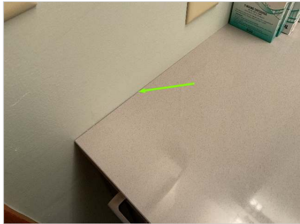
full bath sinktop