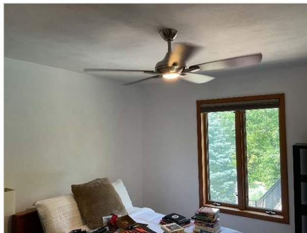
left rear bedroom

The paddle fan in the rear bedroom appears to be out of balance because it is loose in the ceiling box. The fan wobbles when turning. The fan could be improperly installed or the mounting screws are loose. Consult with a qualified contractor for evaluation and repair.