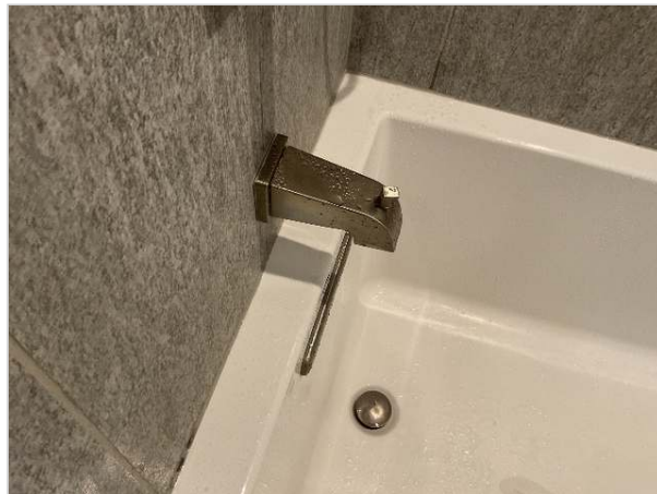
loose tub spout