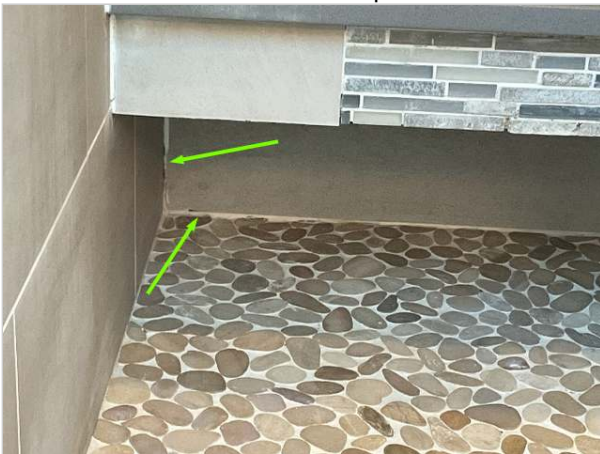
shower base - master bath