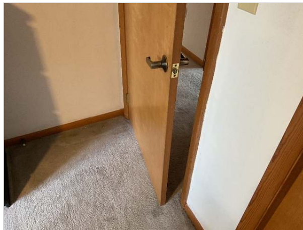
left rear bedroom

One or more of the interior doors sticks or is otherwise in need of adjustment. The door was noted in the bedroom. While we noted that this condition exists during the inspection, it does not constitute a safety concern or a material defect. Additionally, the relative humidity can affect sticky doors, so a door that sticks on a humid day may not stick on a dryer day. Repairs to interior doors is usually minor in cost and can be easily corrected by any handyman.