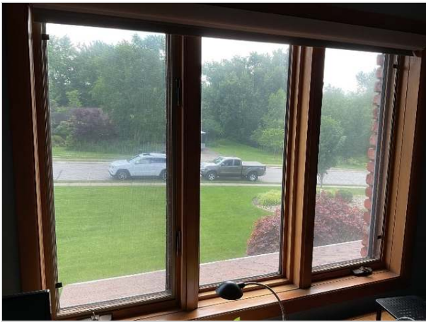
left front bedroom