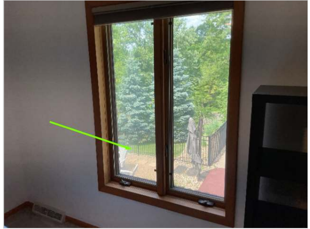
left rear bedroom