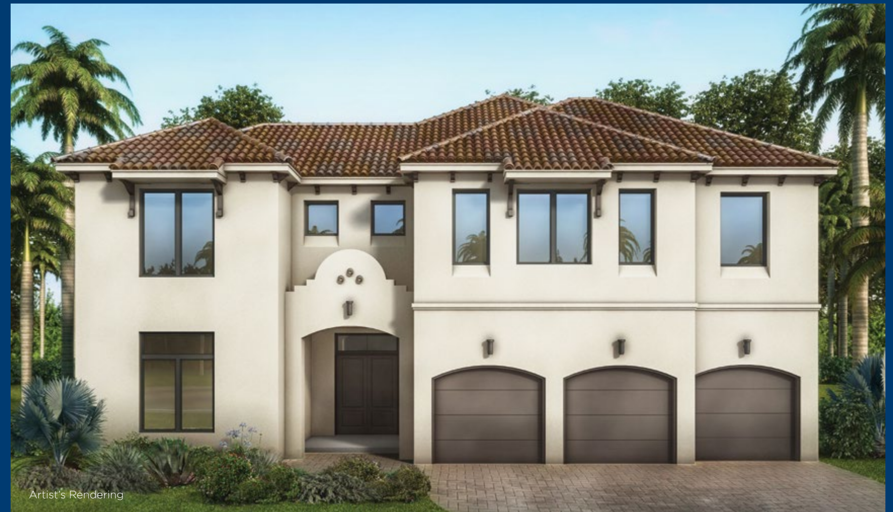
Coral Gables | 3,426 a/c sq. ft. | 4,588 total sq. ft.