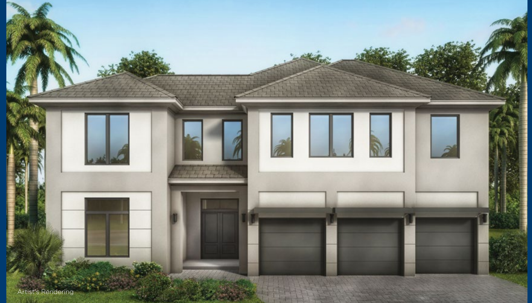
Aventura | 3,426 a/c sq. ft. | 4,588 total sq. ft.