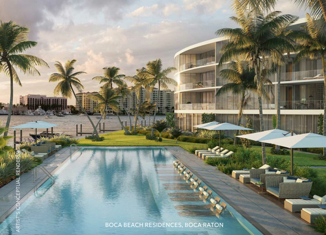
BOCA BEACH RESIDENCES, BOCA RATON