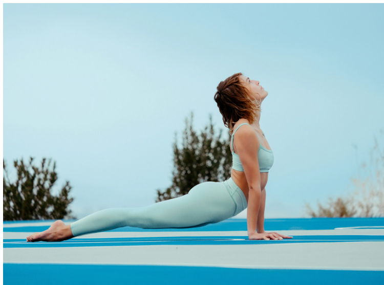
ROOFTOP AMENITY WITH YOGA, FITNESS STUDIO AND PICKLEBALL COURT