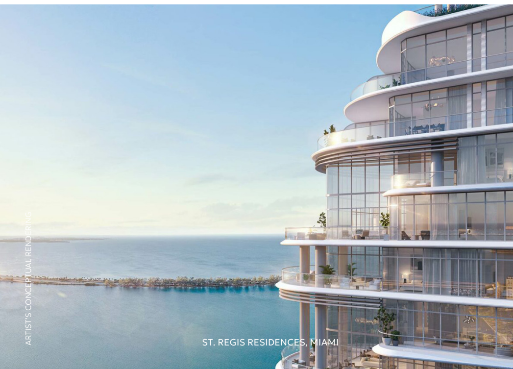
ST. REGIS RESIDENCES, MIAMI