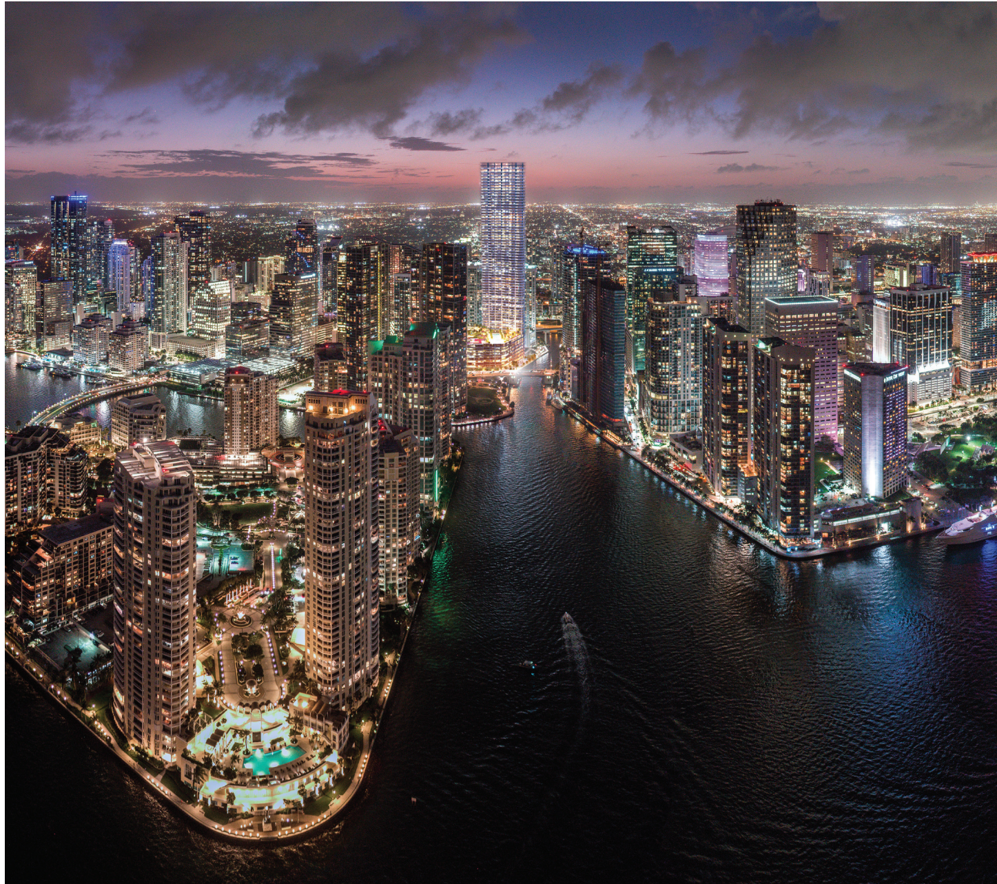
Above: Artist's Conceptual Rendering