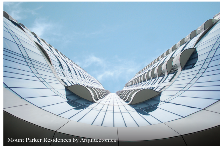
Mount Parker Residences by Arquitectonica