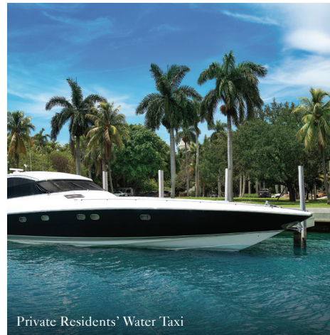
Private Residents' Water Taxi