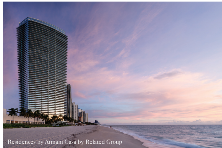
Residences by Armani Casa by Related Group

Renowned Swiss landscape architect Enzo Enea of Zurich-based Enea Garden, is one of the leading landscape architects in the world. A hallmark of Enzo Enea's work is the fusion of indoor and outdoor spaces, the creative intertwining of the soul of the residence with its surroundings.