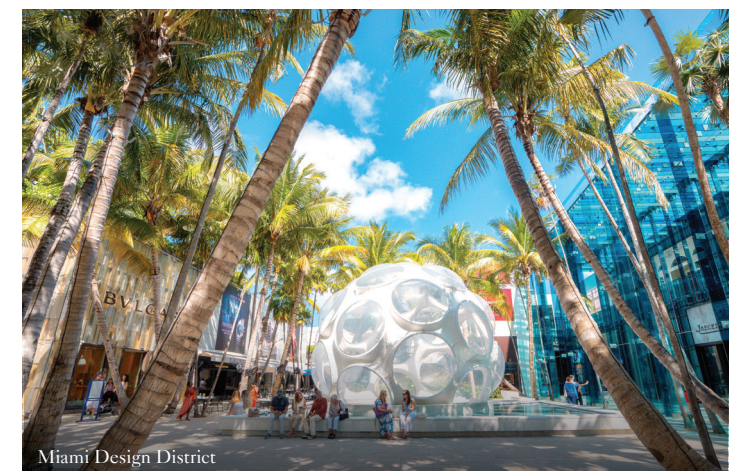
Miami Design District