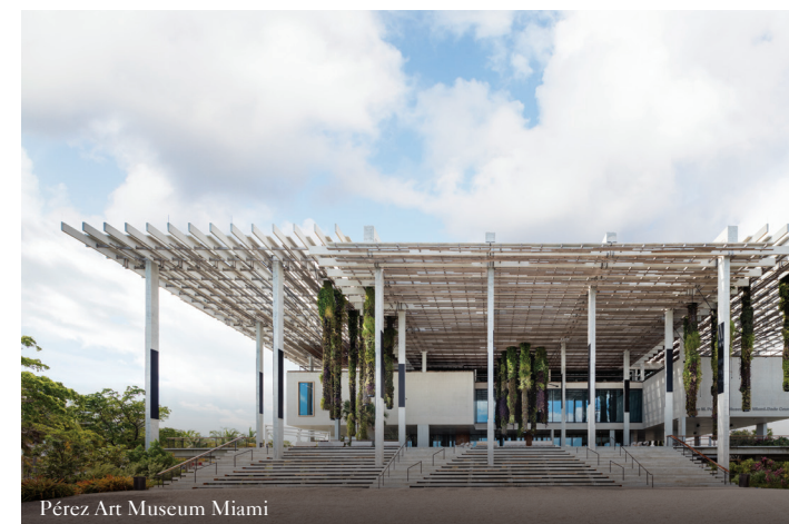
Pérez Art Museum Miami