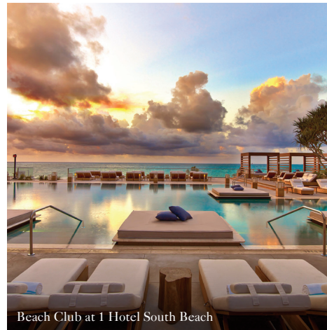
Beach Club at 1 Hotel South Beach

The private marina, planned riverside restaurant and lushly landscaped river promenade invite residents to spend hours and days luxuriating in the infinite energy and organic sparkle of life by the water. Watch the superyachts come and go, take a sunset stroll towards the bay, or head to a number of chic waterside restaurants courtesy of our private water taxi service. Residents can enjoy private membership and exclusive access to the Beach Club at 1 Hotel South Beach, SH Hotels & Resorts sister property. With loungers, beach towel services, cabanas, and seaside snack and beverage services, this waterfront community will cater to leisurely hours under the sun. Take a break from the hustle and bustle of the city and unwind with a cool drink in hand and the sand between your toes.