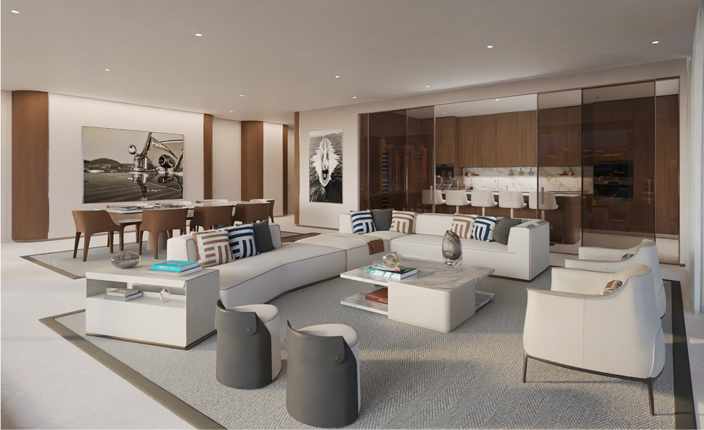
Welcoming living room for gathering and conversation.

Riva Residenze offers 36 two- to six-bedroom luxury residences with stunning oceanfront, marina, and city views. Here, home espouses the sensibility of the yachting lifestyle, interpreted in understated accents and a quiet, purposeful balance of lines and curves.