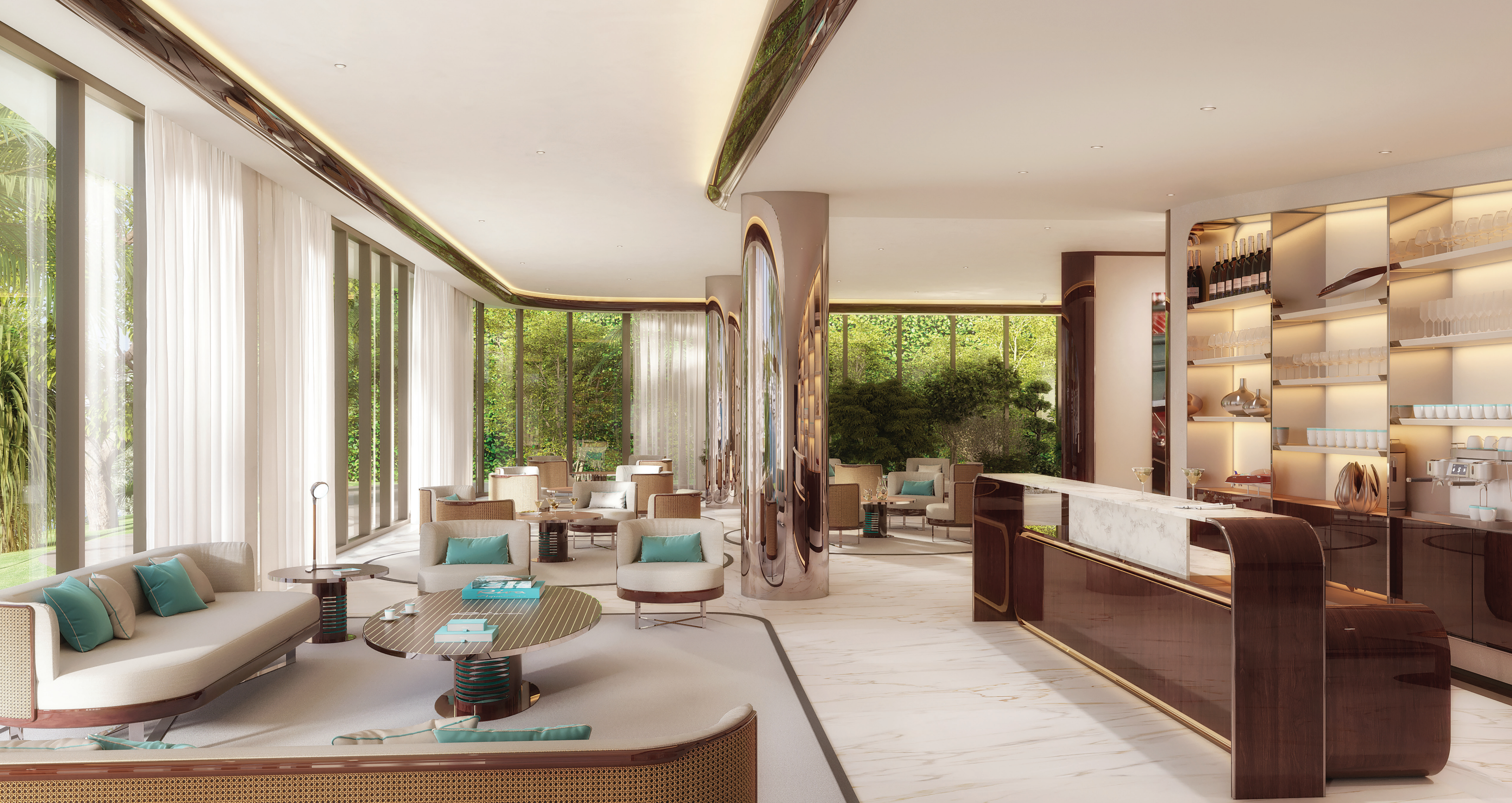
A spacious, inviting ground floor lobby and bar set the stage for intimate gatherings and meaningful conversations.