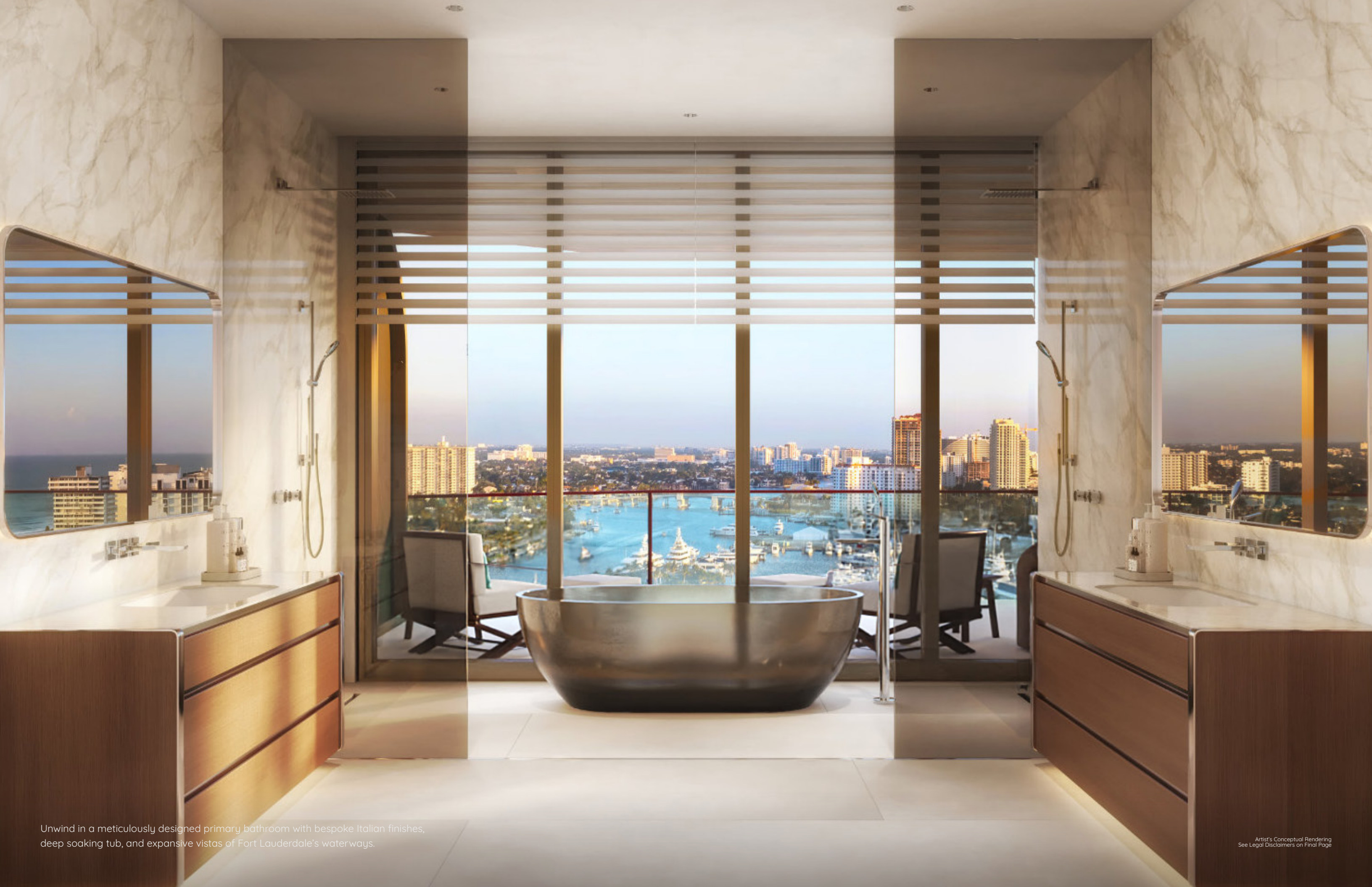
Unwind in a meticulously designed primary bathroom with bespoke Italian finishes, deep soaking tub, and expansive vistas of Fort Lauderdale's waterways.