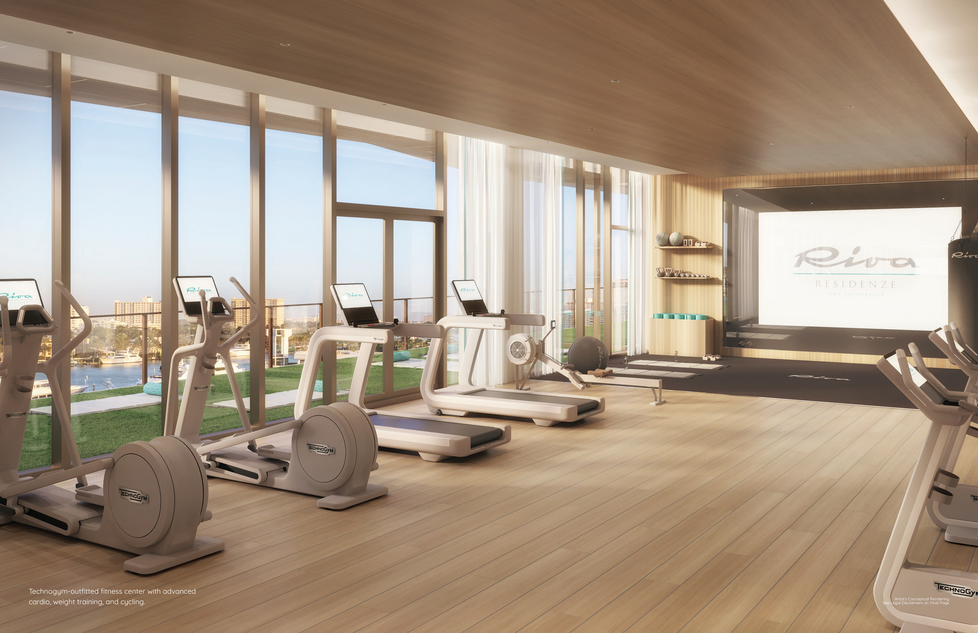
Technogym-outfitted fitness center with advanced cardio, weight training, and cycling.

Artist's Conceptual Rendering See Legal Disclaimers on Final Page