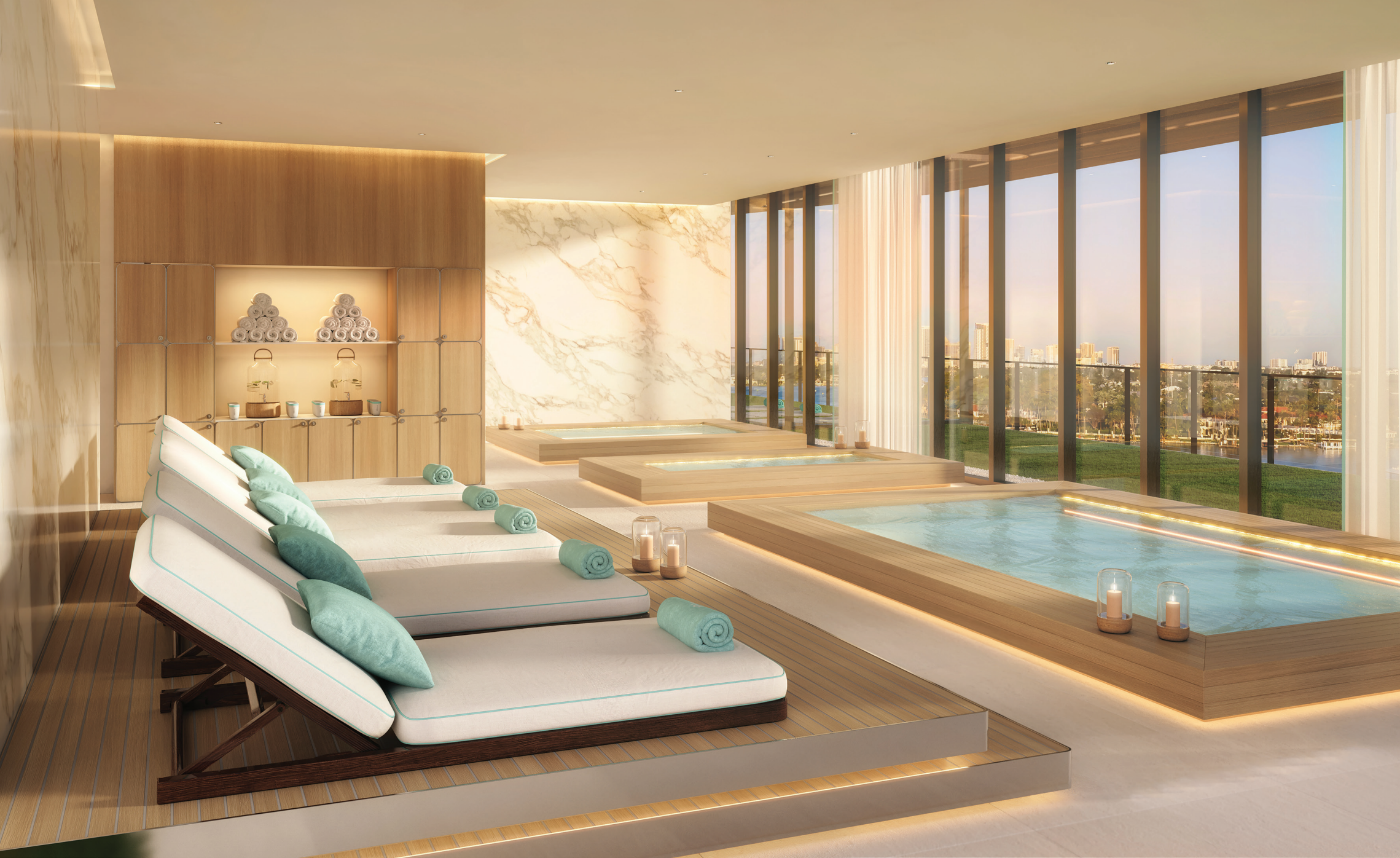
Transformative sanctuary with heated spa, steam and sauna rooms, and bespoke treatments.

With over 20,000 SF of dedicated amenity space, each amenity at Riva Residenze is its own point of arrival, thoughtfully designed to create a sense of movement and balance that touches every sense. As with the streamlined, curved interiors of a yacht gliding through water, every space unfolds in a crescendo of experiences—a curated art gallery, a serene garden, a sunrise bar and lounge, a sunlit executive boardroom—all leading up to a tranquil sky lounge and sun deck.