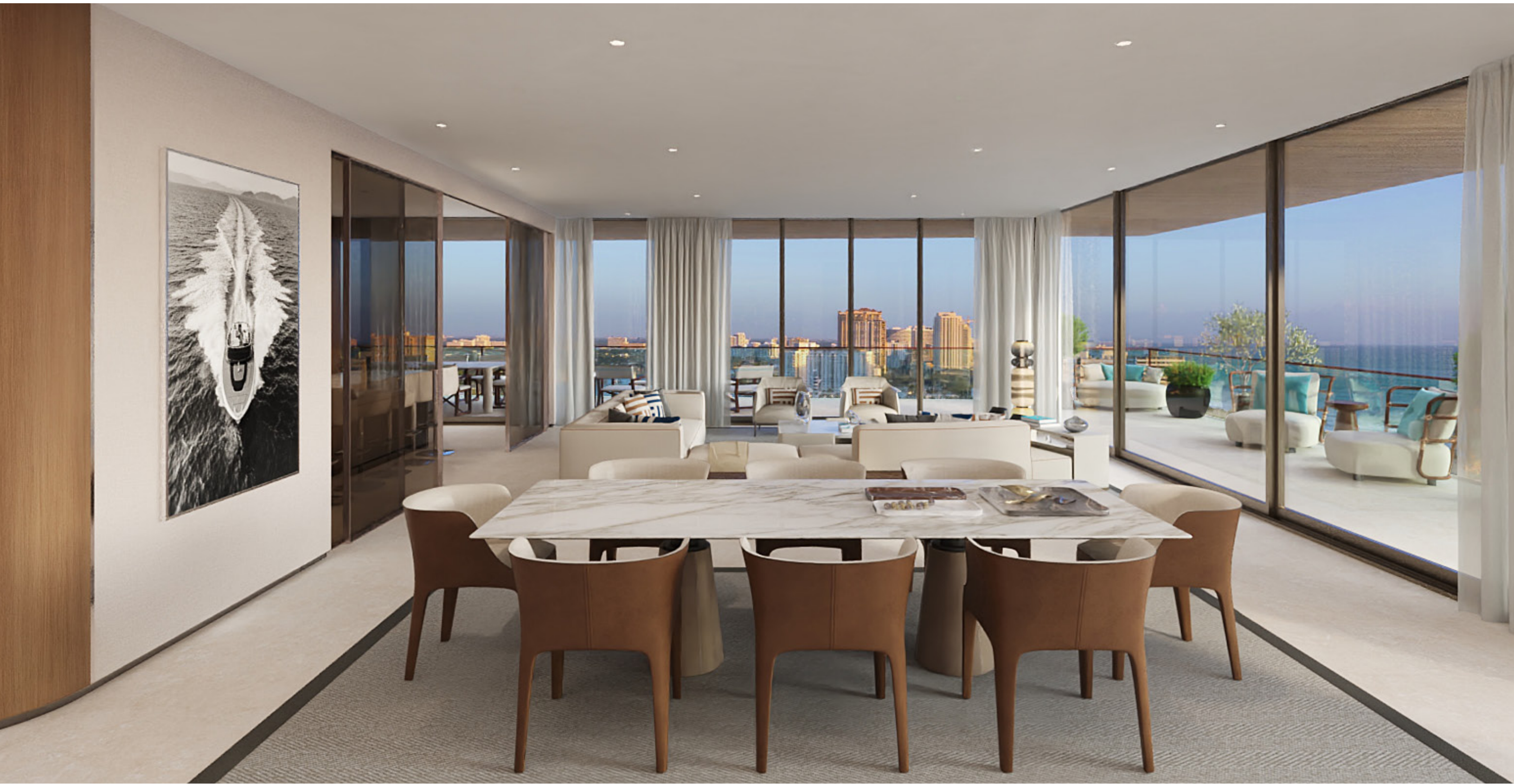
Spacious interiors seamlessly blend dining, lounging, and entertaining—framed by uninterrupted views of the Atlantic.