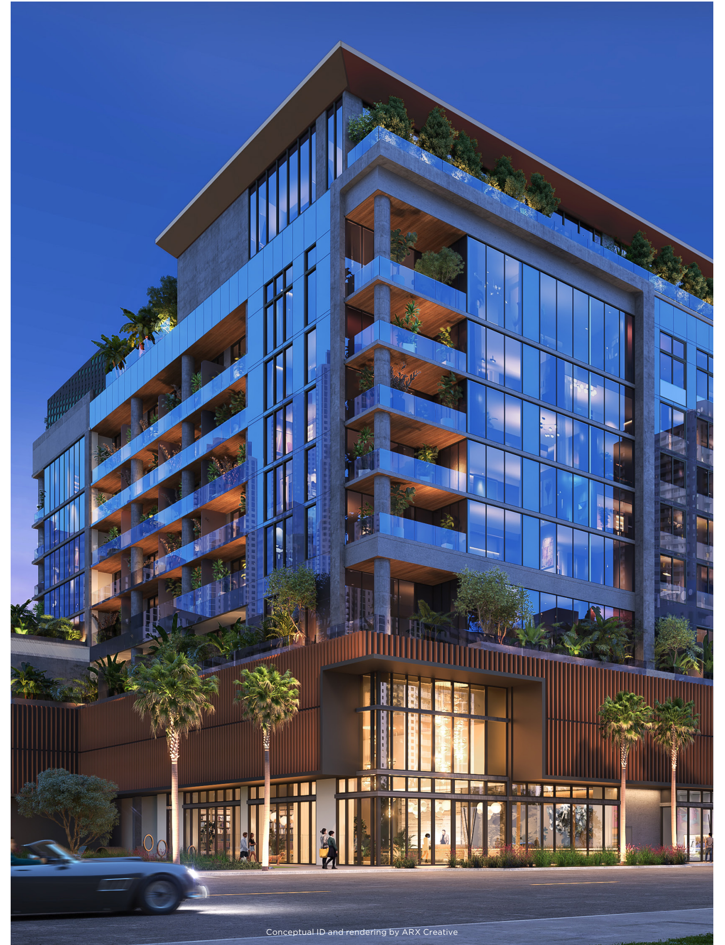
Conceptual ID and rendering by ARX Creative