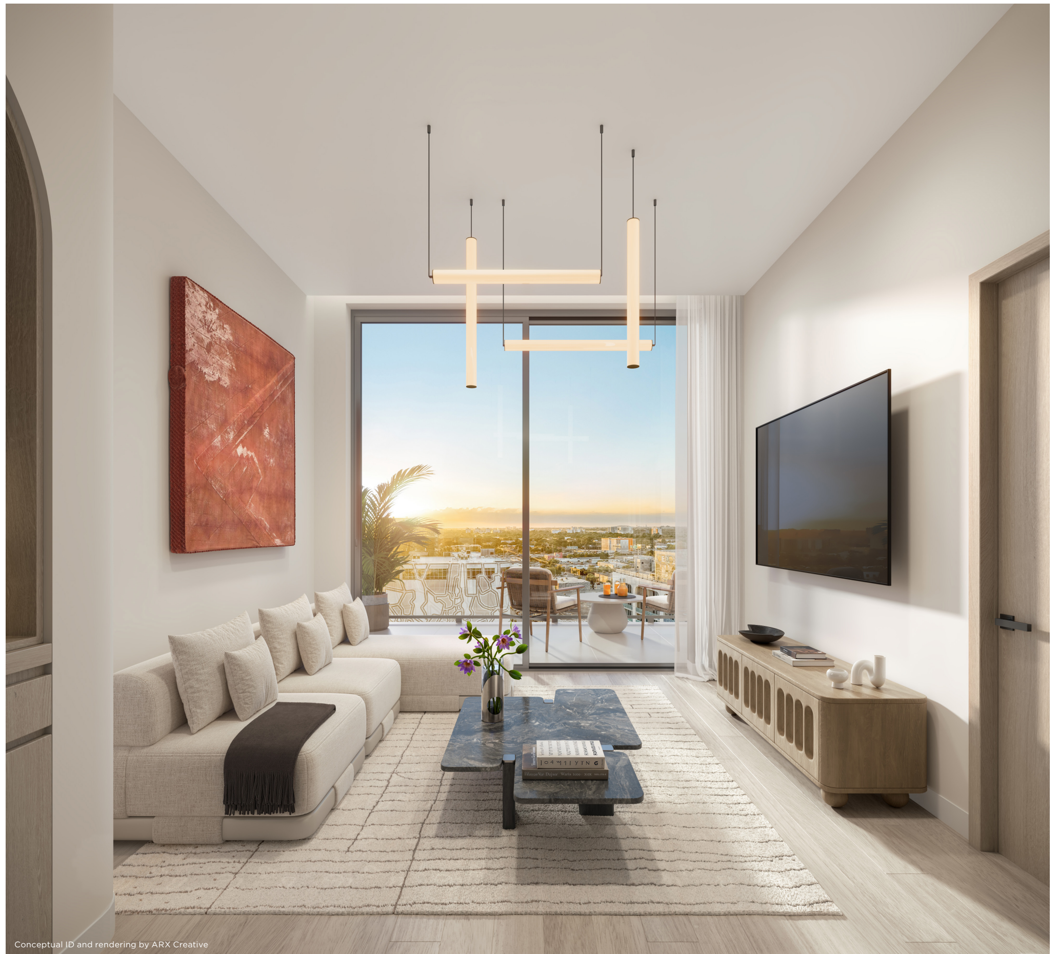
Conceptual ID and rendering by ARX Creative