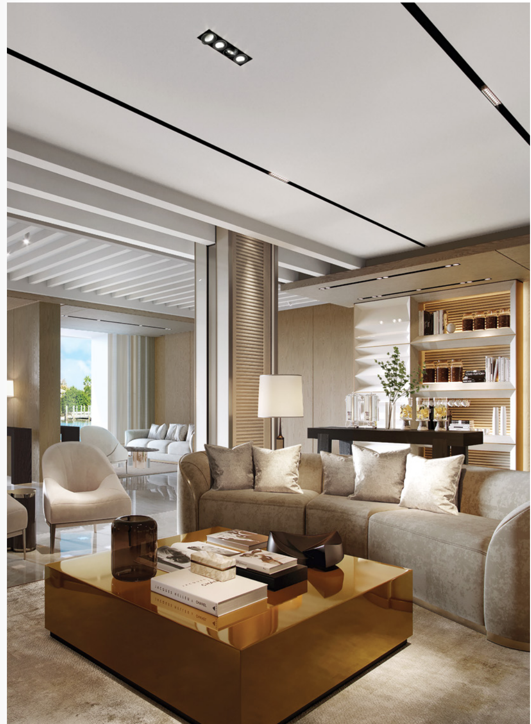
In the waterfront lounge, maritime-inspired materials and a refined palette of colors exude a relaxed aura of coastal calm for residents and guests.

In tandem with the distinguished courtesies of anticipatory service, this suite of masterfully-choreographed amenities not only accommodates, but elevates most any desire; transforming comfort and convenience into an exceptional experience in living.