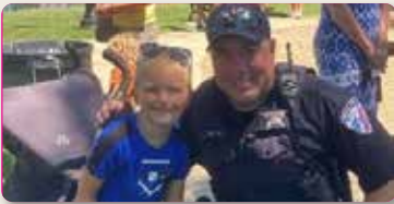
Enjoying Time with the IPD (p4)