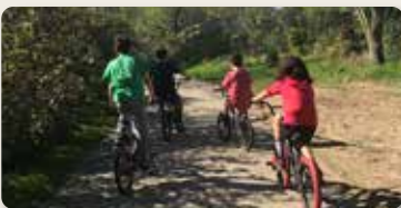
Connecting Itasca (p12)