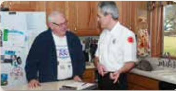
Home Safety Visits (p8)