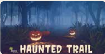
Community Calendar (p6)