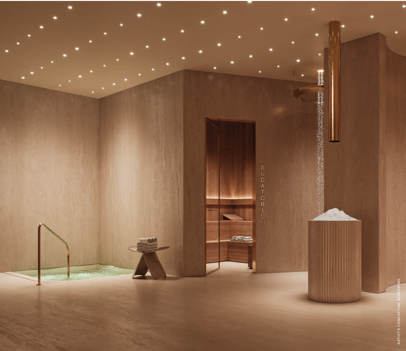
GYM & SPA WITH JACUZZI, COLD PLUNGE, AQUATHERAPY, SENSORY, AND SHOWERS