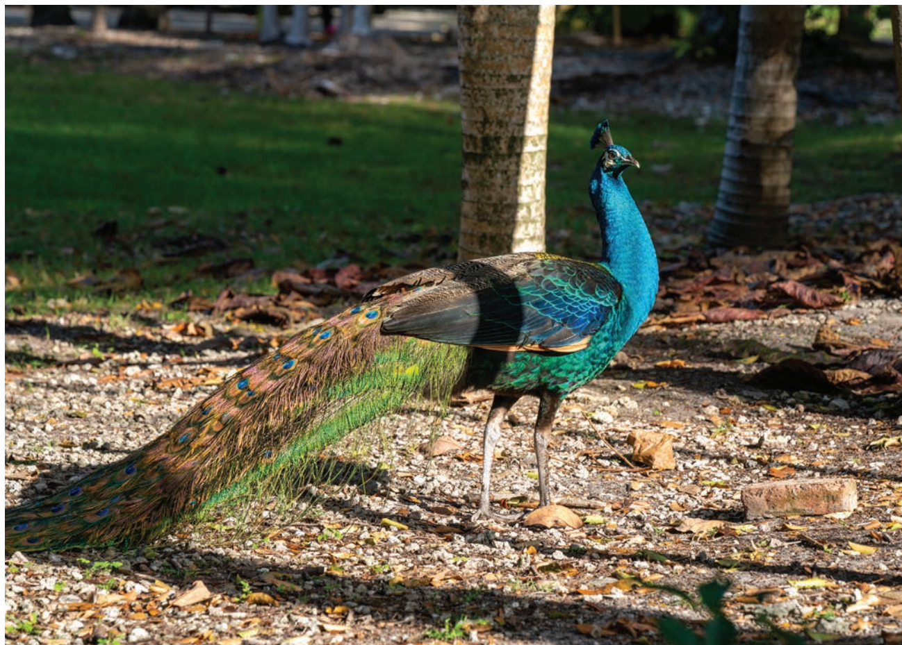
BISCAYNE BAY & PEACOCK PARK