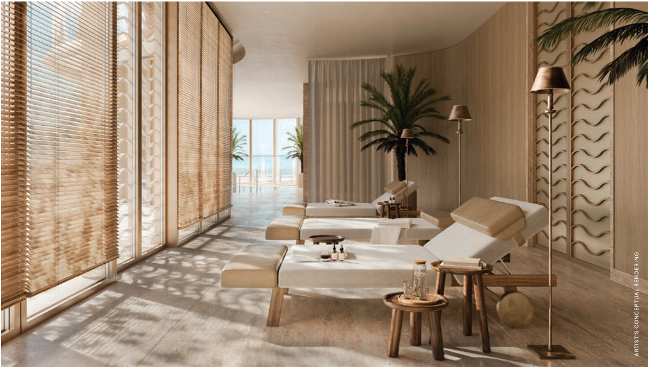
HAMMAM & LOUNGE AREA