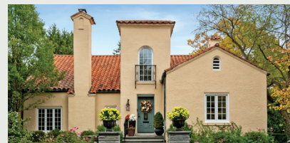
1001 Wildwood Ln, Highland Park