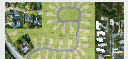
Glencoe Estates | New Development