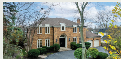
1074 Carlyle Ter, Highland Park