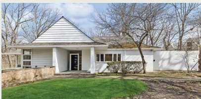
155 S Deere Park Dr, Highland Park