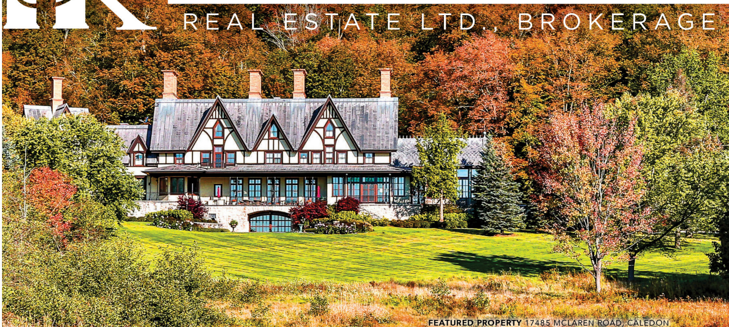
FEATURED PROPERTY 17485 MCLAREN ROAD, CALEDON