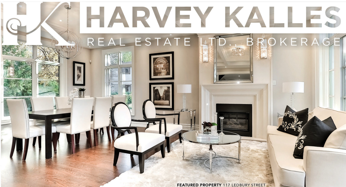
FEATURED PROPERTY 117 LEDBURY STREET