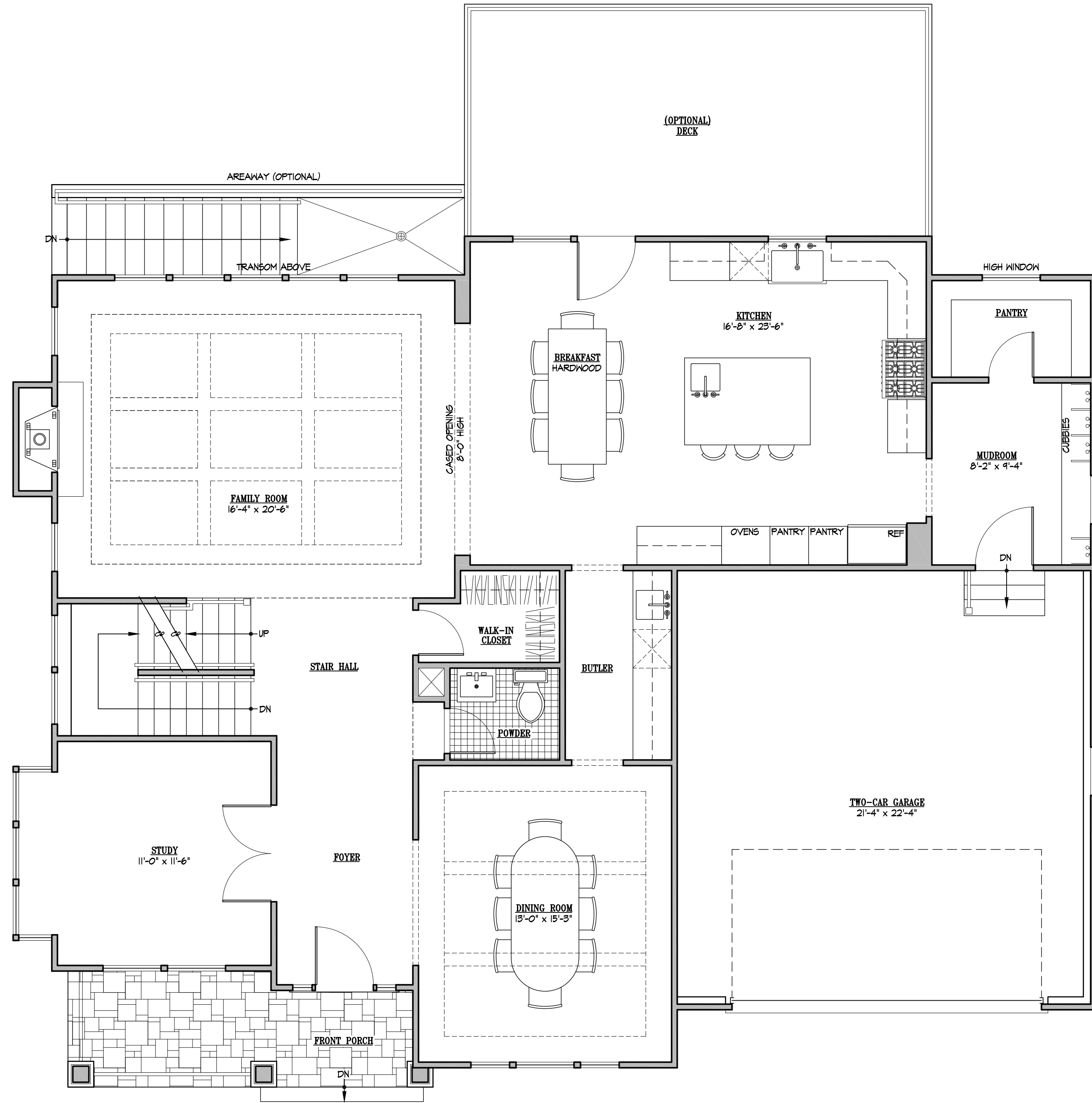
1 FIRST FLOOR PLAN A2 SCALE: 1/4" = 1'-0"