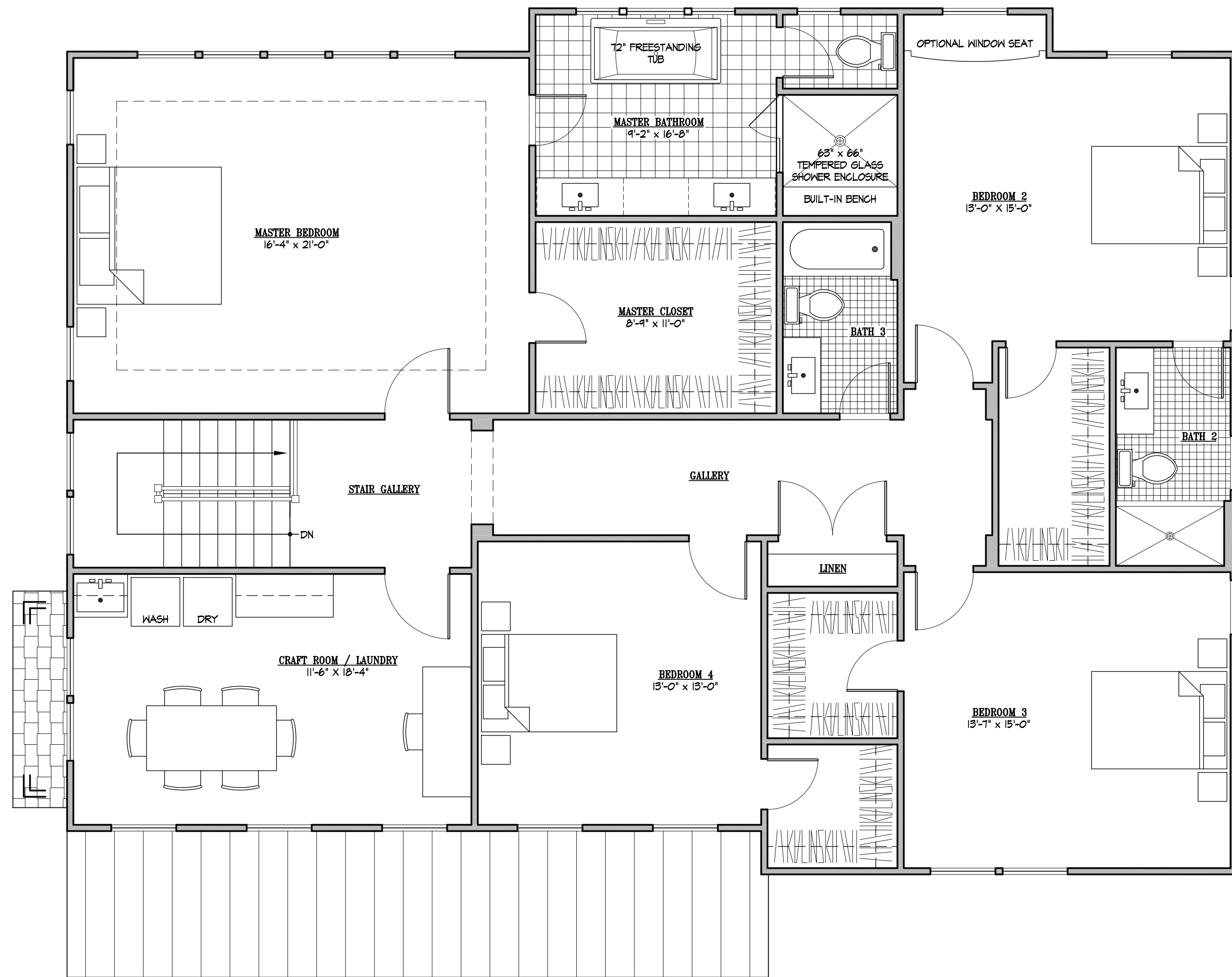
1 SECOND FLOOR PLAN - OPTION A A3 SCALE: 1/4" = 1'-0"