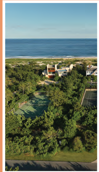
39 TIMBER TRAIL: COURTESY OF THE AGENCY HAMPTONS; 1370 MEADOW LANE: COURTESY BESPOKE REAL ESTATE

Nothing short of magnificent, this turnkey beauty sits on 2.6 private acres with 125 feet of Atlantic frontage. Designed by the late East End architect Francis Fleetwood, the Shingle-style estate includes deeded access to Southampton's pristine beaches and a private boardwalk that leads straight to the sand. Listed at $55 million, the move-in ready residence was completely renovated in 2016. In addition to herringbone floors, antique lighting, and an elevator servicing all levels, the house includes expansive floor-to-ceiling windows and glass doors that offer sweeping panoramas of the ocean and Shinnecock Bay. The primary suite—one of eight bedrooms—boasts a terrace, sitting area, and spa bath with soaking tub and steam-and-rain shower. Visitors can choose from four breezy, ensuite guest rooms, all of which open onto a wraparound deck that connects the home's outdoor living and dining areas. Grand entertaining spaces include a formal dining room, a custom kitchen with Sub-Zero fridges, and an octagonal living room with a fireplace and trifold doors that open to ocean breezes. Surrounded by lush privacy hedges, the grounds include a Har-Tru tennis court and a heated 40-foot pool with sundeck. To tour 1370 Meadow Lane, contact Bespoke Real Estate at (631) 500-9030.