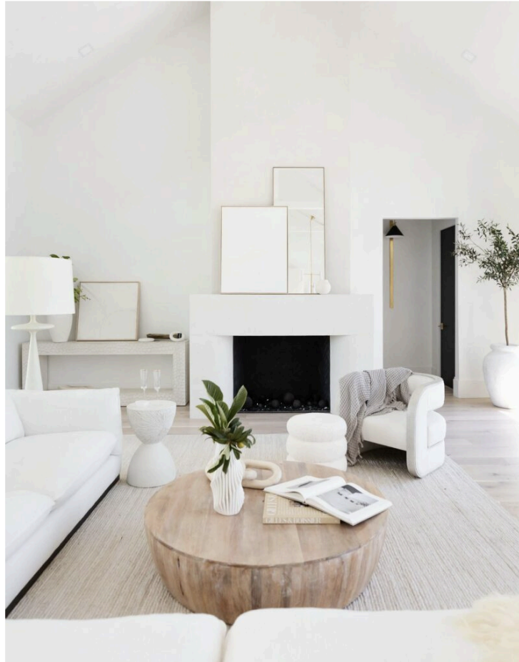
Real estate and interior design

DNN: Coming from a background in real estate, what was the moment you knew interior design was for you?