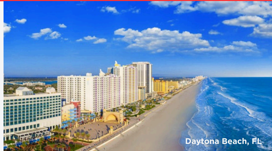
Daytona Beach, FL

Volusia County attracted 4.5 million visitors in 2024, reinforcing the market's strength as a premier Florida tourism destination. The asset further benefits from proximity to Daytona International Speedway, Embry-Riddle Aeronautical University, Halifax Health, and expanding industrial and aerospace employers in the broader Volusia County market.