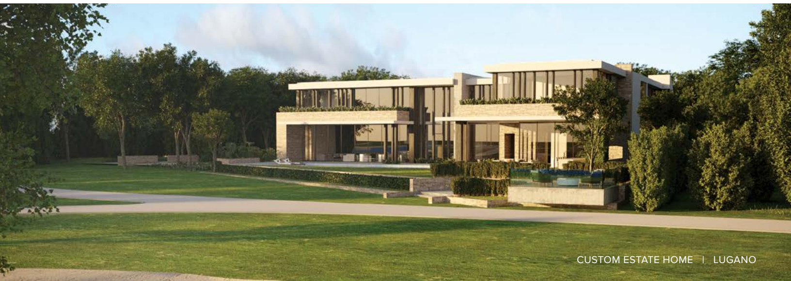
CUSTOM ESTATE HOME | LUGANO