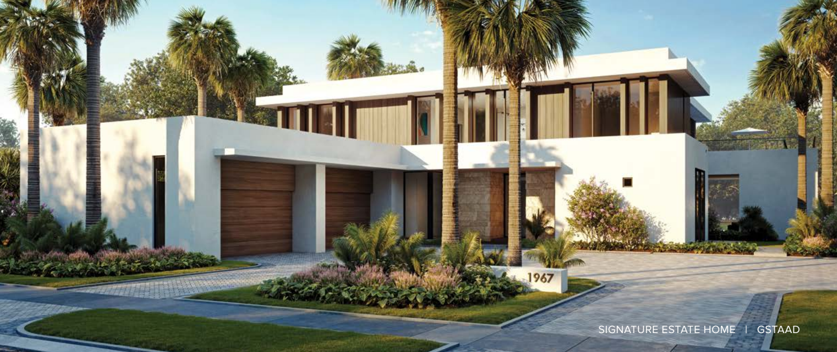
SIGNATURE ESTATE HOME | GSTAAD