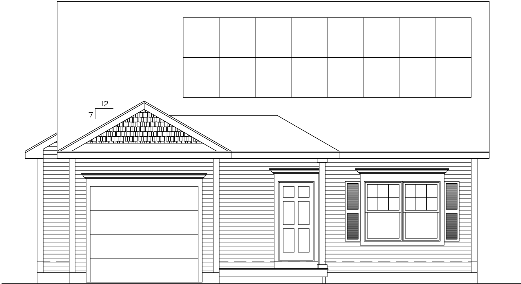
Ashley II Front Elevation