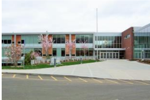
9 - Fairfield Ludlowe High School

Click Here for the Fairfield Master Street List