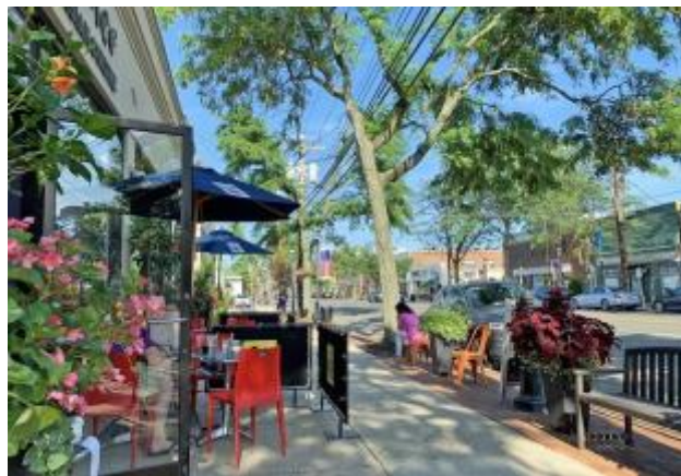
3 - Downtown Fairfield