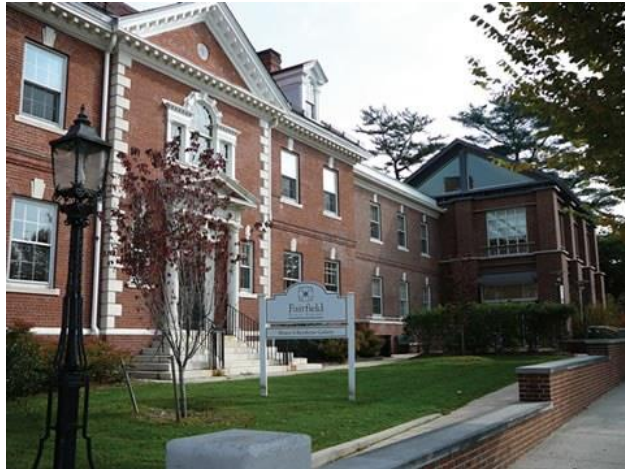
5 - Fairfield Library