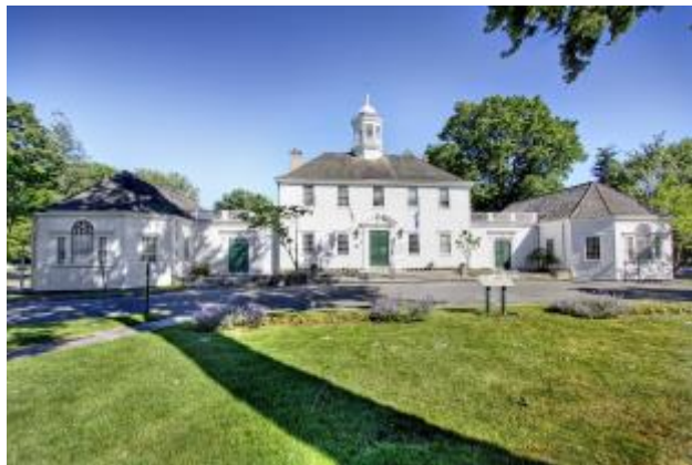
1 - Fairfield Town Hall