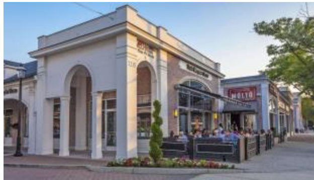
6 - The Brick Walk