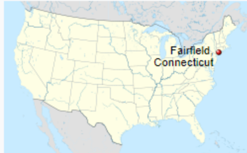
Location in the United States