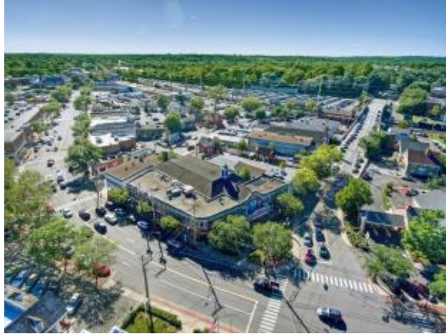
2 - Downtown

The Puritans and Congregationalists from the Massachusetts Bay Colony sought to establish a society subject to their own rules. The Massachusetts General Court granted them access to settle around the Hartford area. In 1639, the Fundamental Orders was formed and established Connecticut as a self-ruled entity. One of the framers of the Fundamental Orders, Roger Ludlowe, purchased a large piece of land from the Pequonnock Indians, and the town of Fairfield was established.