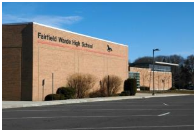
8 - Fairfield Warde High School

Fairfield through the Continuing Education Program, offers a variety of programs including GED and ESL classes as well as some evening programs. Fairfield is enriched by the presence Fairfield University and Sacred Heart University, a variety of private and parochial schools from grades K -12, and a number of preschool options.