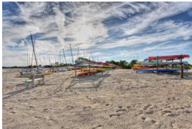
4 - Jennings Beach