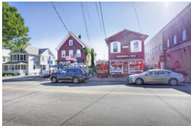
7 - Firehouse Deli, Reef Road