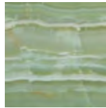
Camelia Green Marble