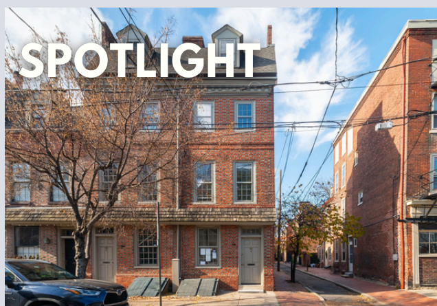
758 S FRONT ST PHILADELPHIA, PA

Extremely rare 4 bedroom renovation in the Meredith School Catchment. This meticulously renovated 1860s gem boasts 3 levels, 4 bedrooms, 3 full bathrooms, and White Oak Hardwood flooring throughout.