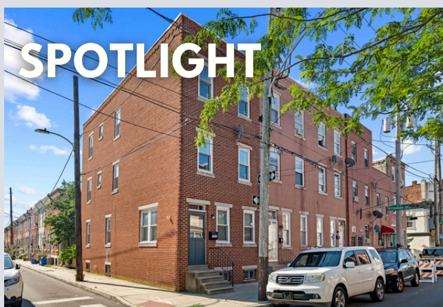
1805 S 5TH ST PHILADELPHIA, PA

This three-story home offers an abundance of living space with 6 bedrooms and 2 full baths, making it ideal for large households, multi-generational living, or those seeking additional work-from-home or guest accommodations.