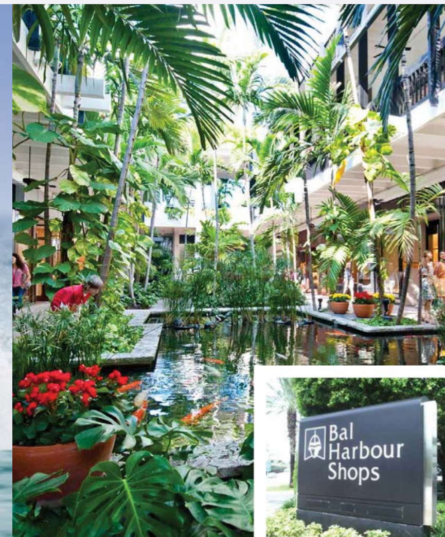
At the same time, the Peloro neighborhood is close to all the glitter and glamour that makes the beach famous - five-star restaurants and chic bistros, luxe resorts and spas, world-class designer boutiques, eclectic shops, thrilling night life, boating, sunny shores, and an effervescent energy unlike anywhere else.