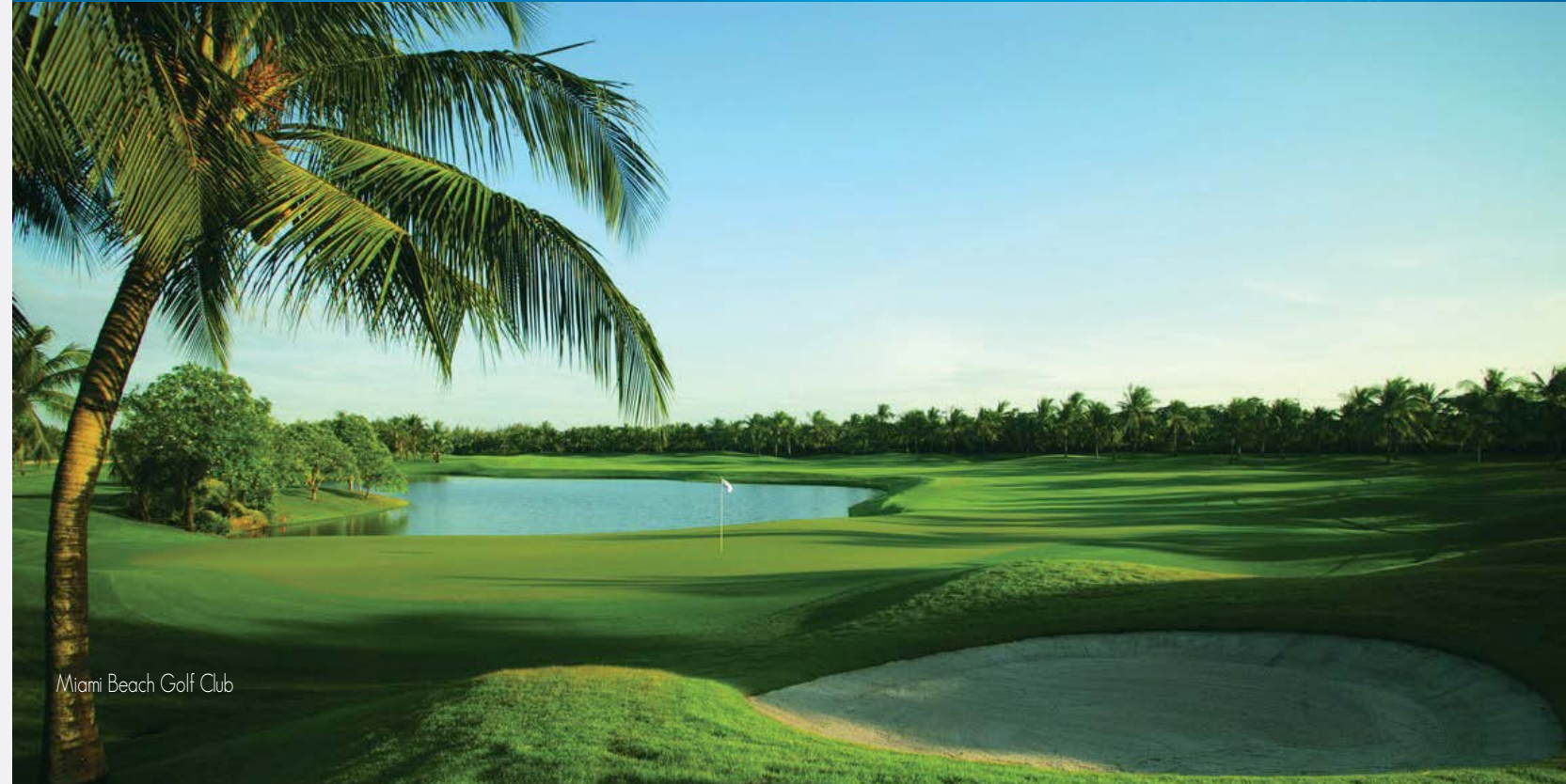
Miami Beach Golf Club