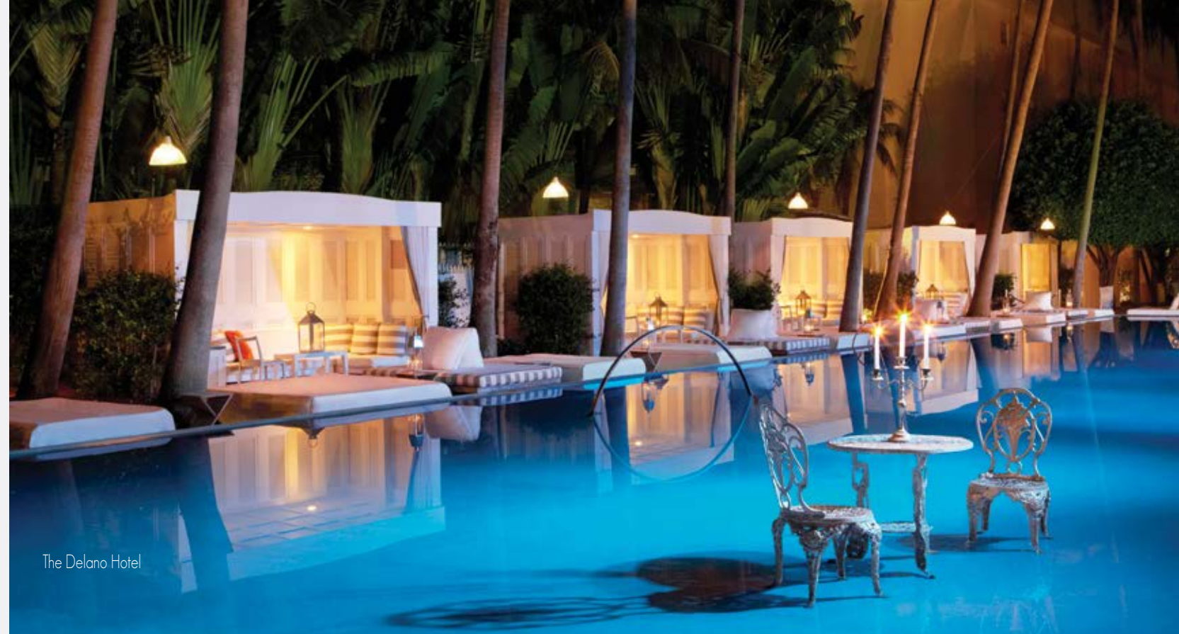
The Delano Hotel

*Peloro Lifestyle Club reimburses the lesser of $2000 or 50% of first-year membership costs to area beach, sport, and other clubs. Membership must be secured prior to closing on your Peloro residence. Other details and restrictions may apply.