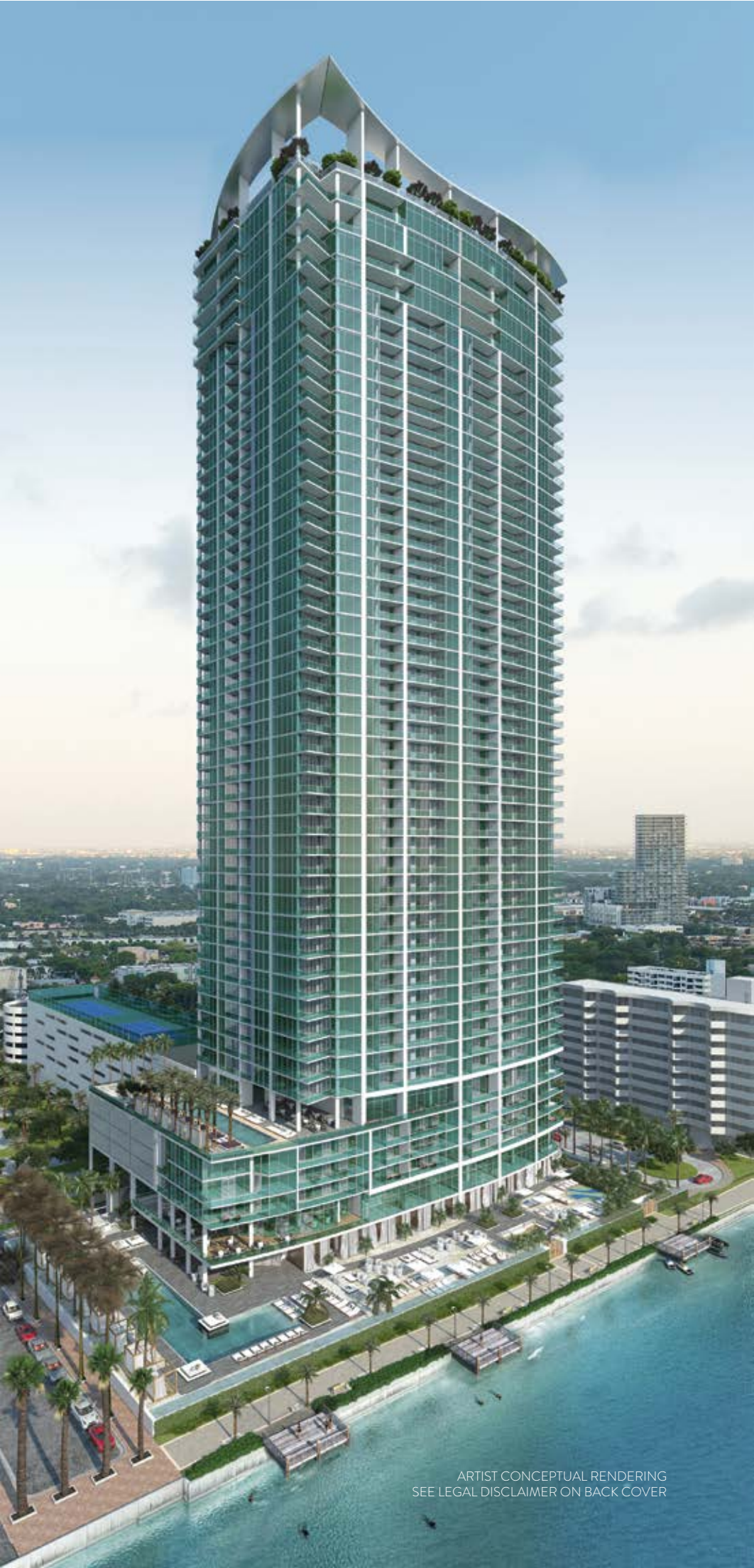
ARTIST CONCEPTUAL RENDERING SEE LEGAL DISCLAIMER ON BACK COVER

Preconstruction prices range from the $400,000’s to multi-million dollar penthouses.