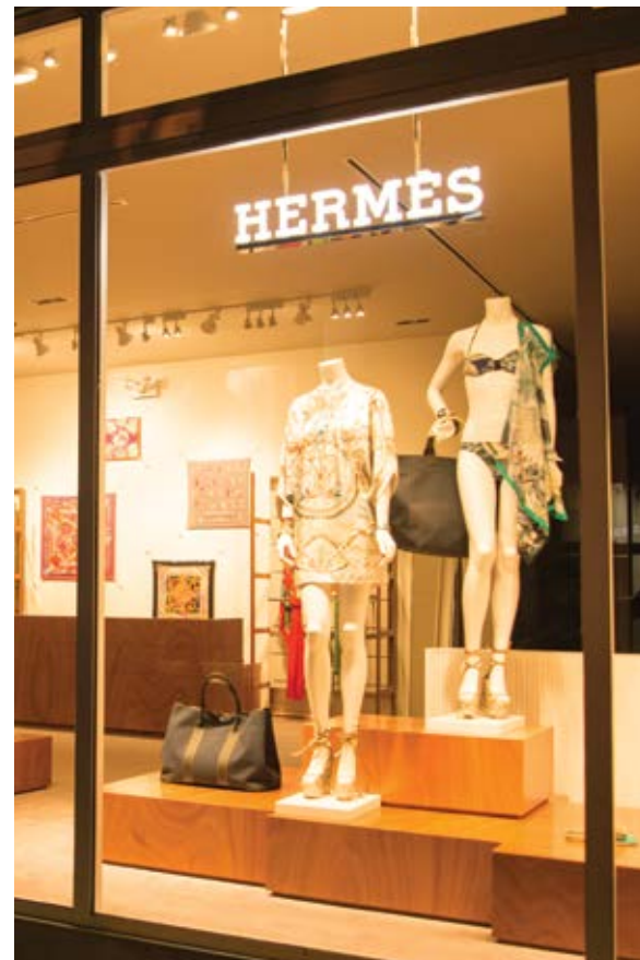
LUXURY SHOPS IN THE MIAMI DESIGN DISTRICT