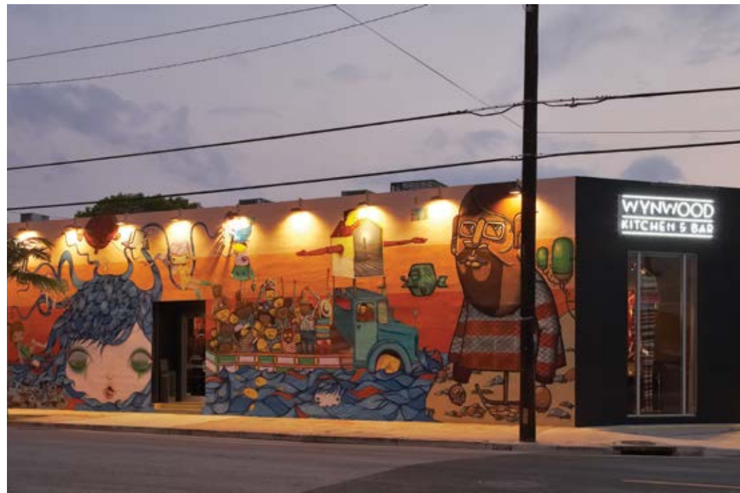
WYNWOOD KITCHEN & BAR