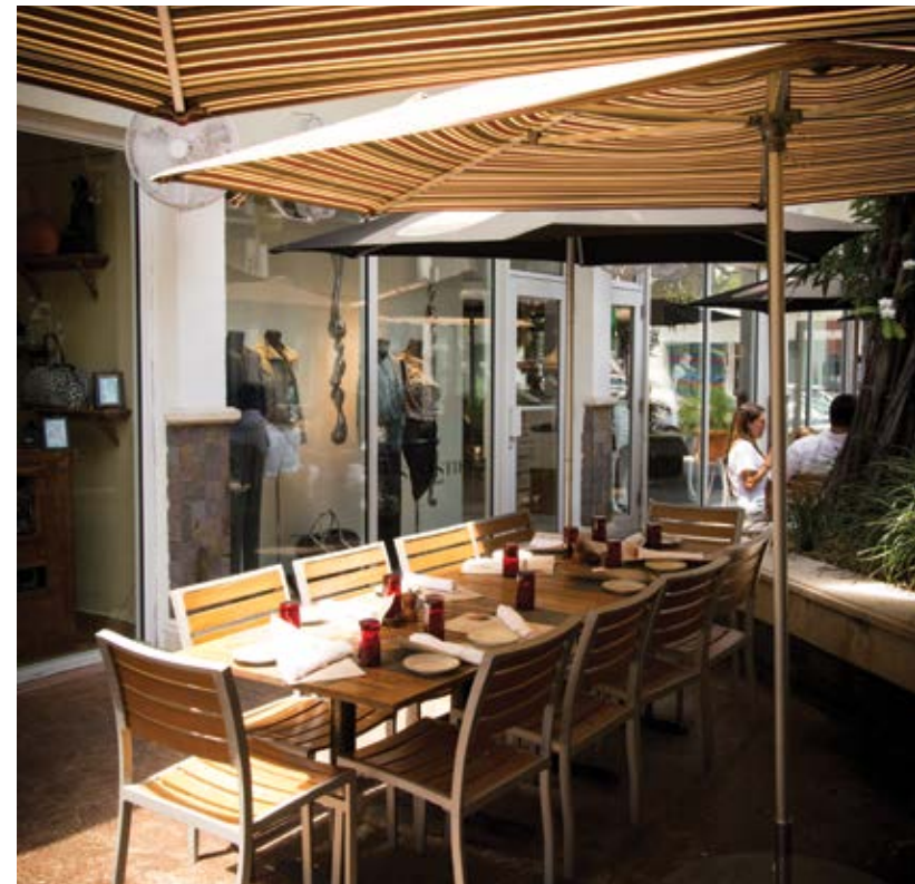
ECLECTIC ALFRESCO DINING IN THE MIAMI DESIGN DISTRICT