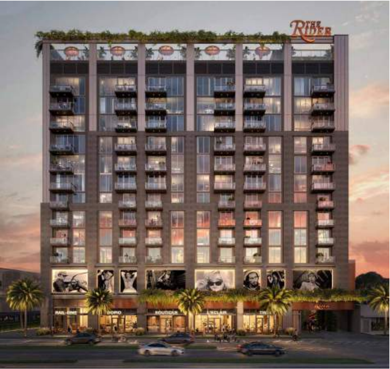
*ALL ARTIST CONCEPTUAL RENDERING. MAY BE CHANGED WITHOUT NOTICE.