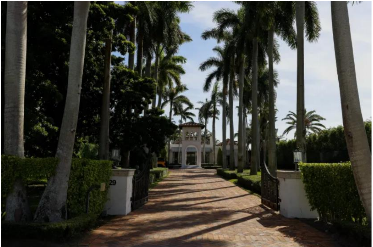
There are only 84 residents on the ultraexclusive Indian Creek Island, dubbed the "Billionaire Bunker."

Inside Miami's 'Billionaire Bunker,' a man-made island for the .01% where billionaires like Jeff Bezos and Mark Zuckerberg shell out for total privacy