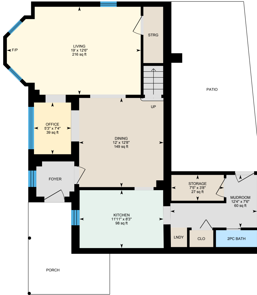
Main Floor Exterior Area 817.67 sq ft

Main Building: Total Exterior Area Above Grade 1428.71 sq ft