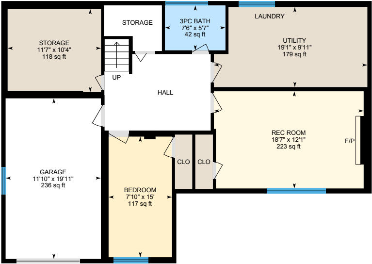
Basement (Below Grade) Exterior Area 843.22 sq ft