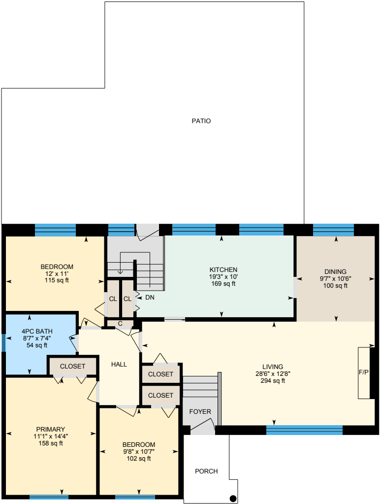
Main Floor Exterior Area 1306.98 sq ft

Main Building: Total Exterior Area Above Grade 1306.98 sq ft