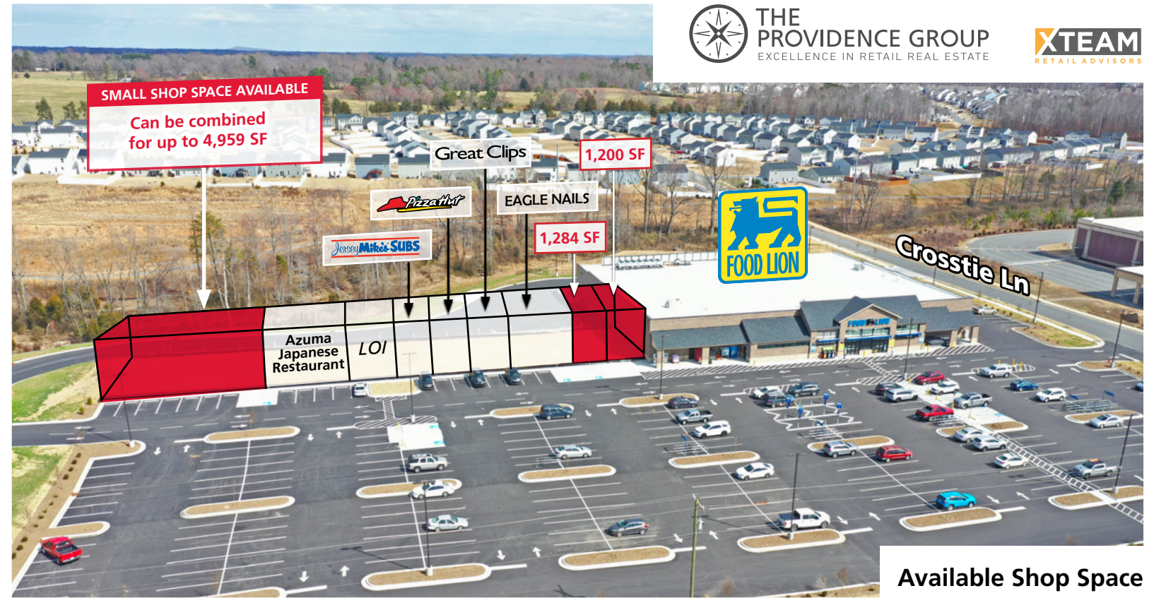
Available Shop Space