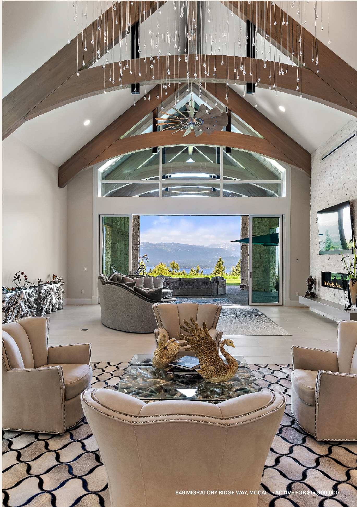
649 MIGRATORY RIDGE WAY, MCCALL - ACTIVE FOR $14,900,000