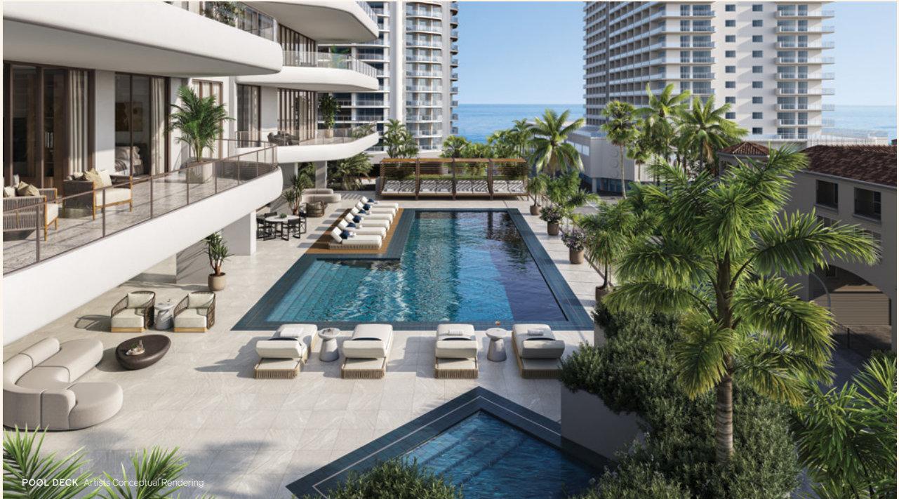
POOL DECK Artists Conceptual Rendering