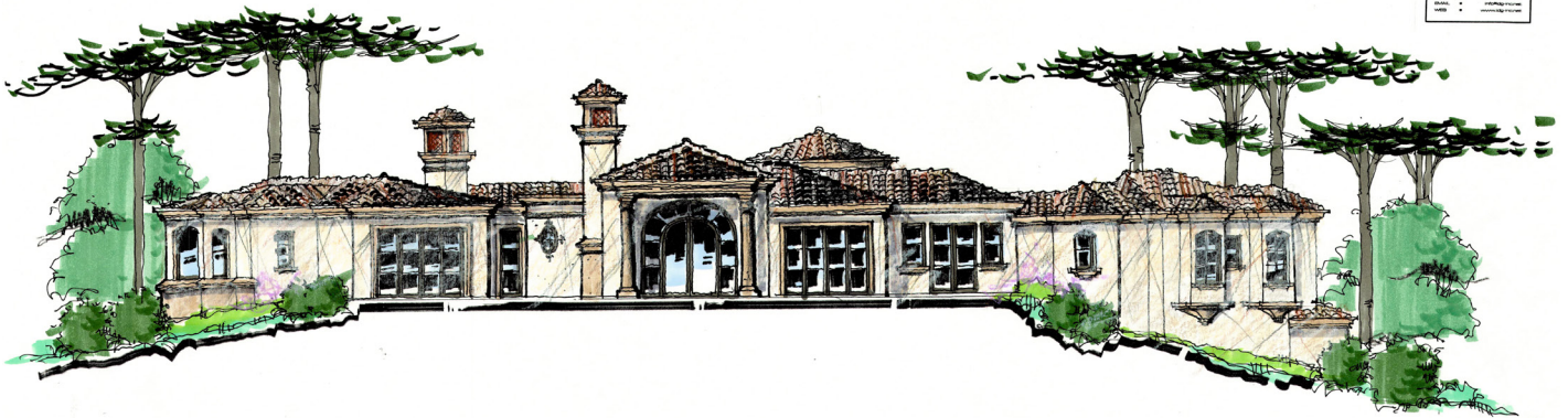
GOLF COURSE ELEVATION