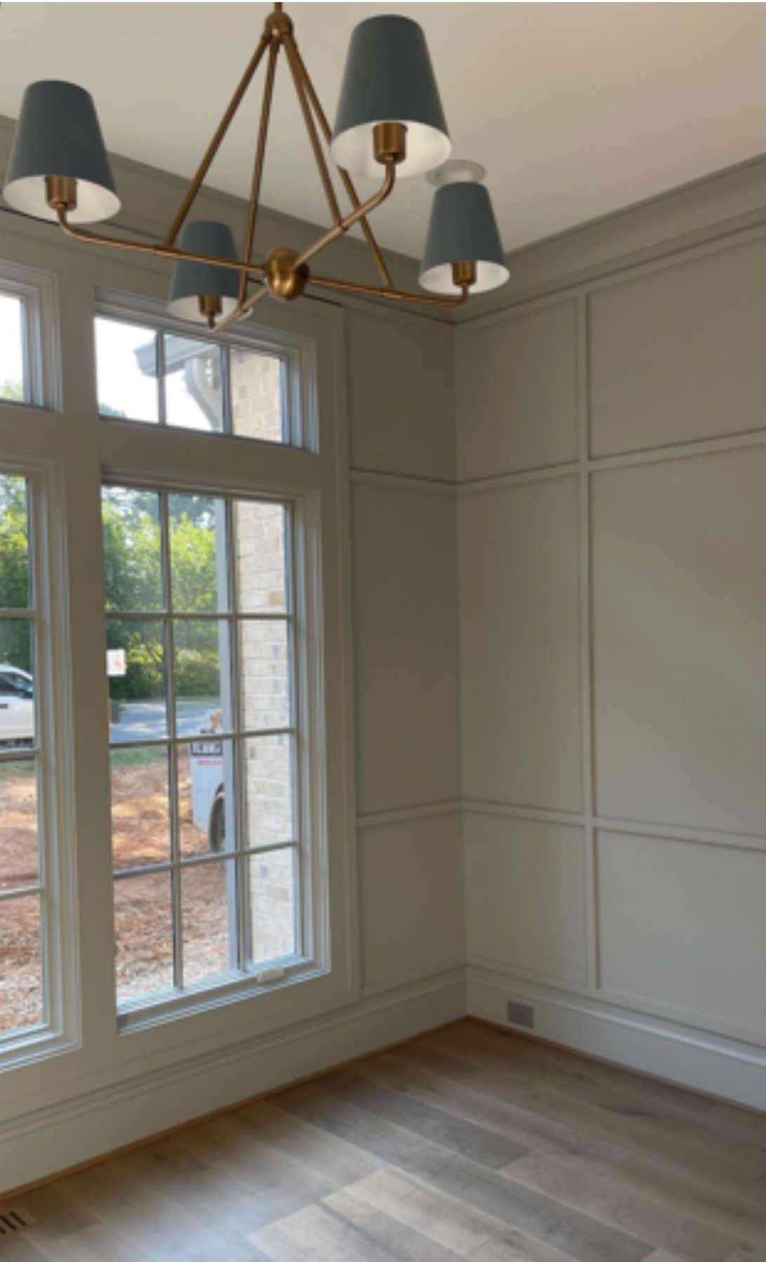
office/first floor guest molding Inspo