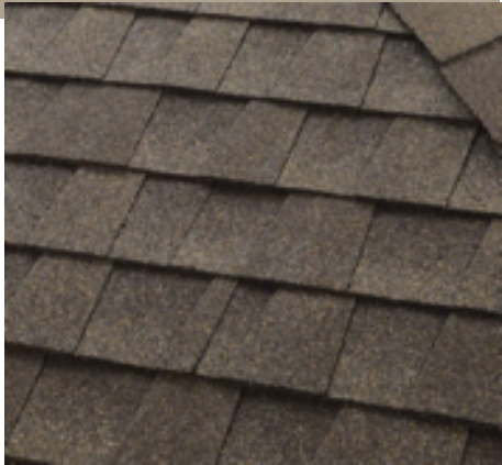
Weather Wood Shingles