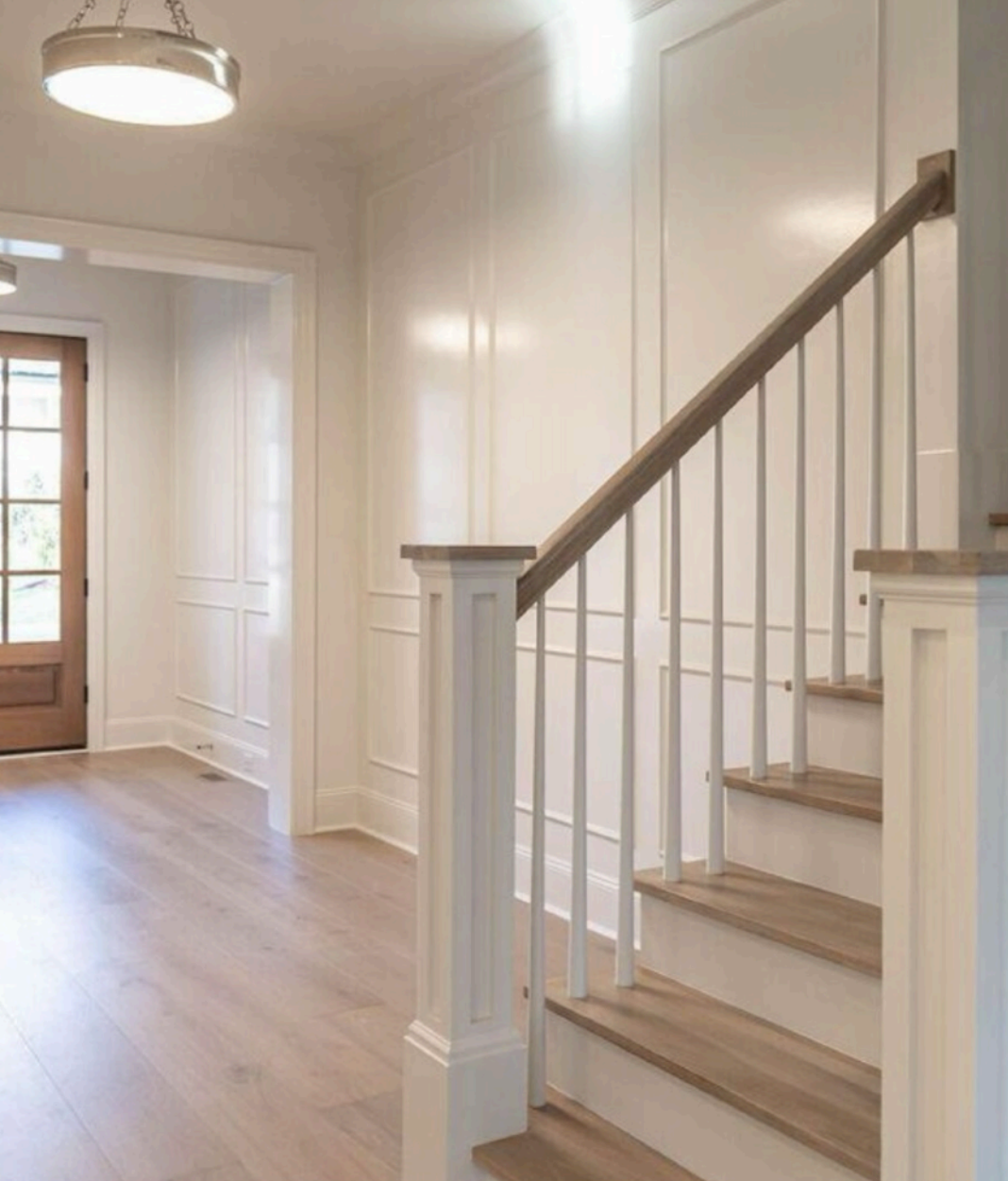
**Foyer- All trim and walls SW7005 Pure White (Satin)**