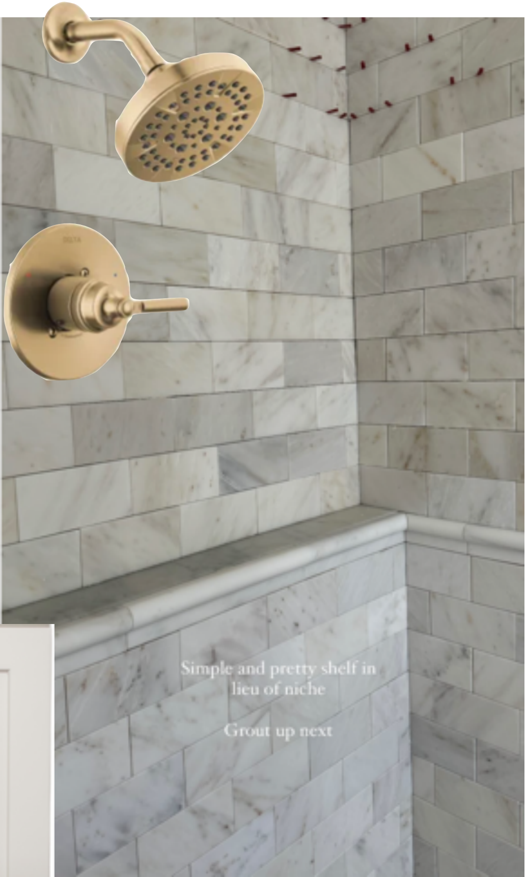
Simple and pretty shelf in lieu of niche Grout up next