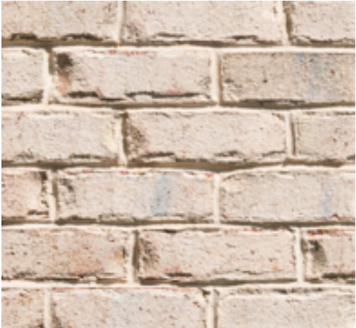
Triangle Brick Oyster Bay