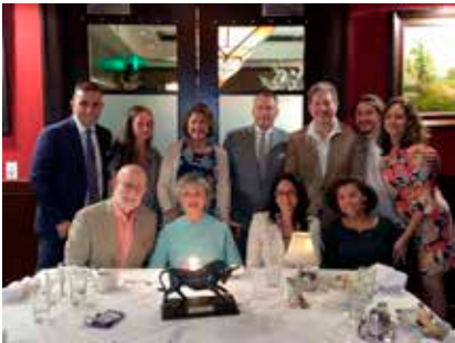
Retirement party from Merrill Lynch with immediate family and team