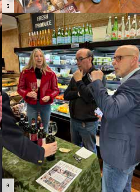
1. Braised beef cheek & tongue en croute with remoulade sauce. 2. Braised short rib tortellini. 3. Smoke salmon pizza with creme fraiche. 4. Confit potato and caviar. 5. Crispy bougerones potato chip. 6. Imported Italian wines