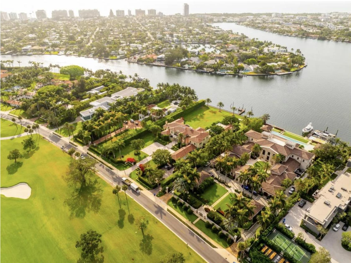
Located directly across Biscayne Bay from Tom Brady and Jeff Bezos on Indian Creek island, Continuum 12000 has good neighbors

“We’re very selective,” Bruce tells me. “We only acquire a small number of large-scale projects. I like to say I’m a buyer of good dirt. We’re not attracted to downtown because it’s too congested. The beach is nice but it’s too expensive. We acquired 12000 for its spectacular location, and more importantly, for the opportunity and vision of what we could create with the waterfront. Whether you’re a resident or investor, pairing prime real estate with waterfront and wellness, you can’t get hurt.”