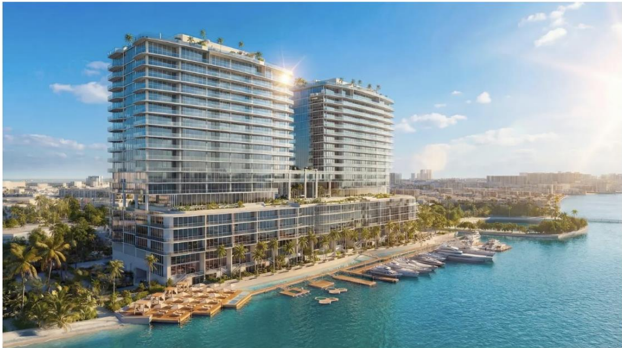
The waterfront at Continuum 12000 wags off the waterfront of North Miami like the fantail of a massive luxury superyacht

All of which is to say I never ended up being the breaking story kind of writer. The marginal exception to this has been the luxury branded real estate space, which, for some reason I can't recall now, I began unpacking over a decade ago long before it became the thing that everyone seems to want to write about these days.