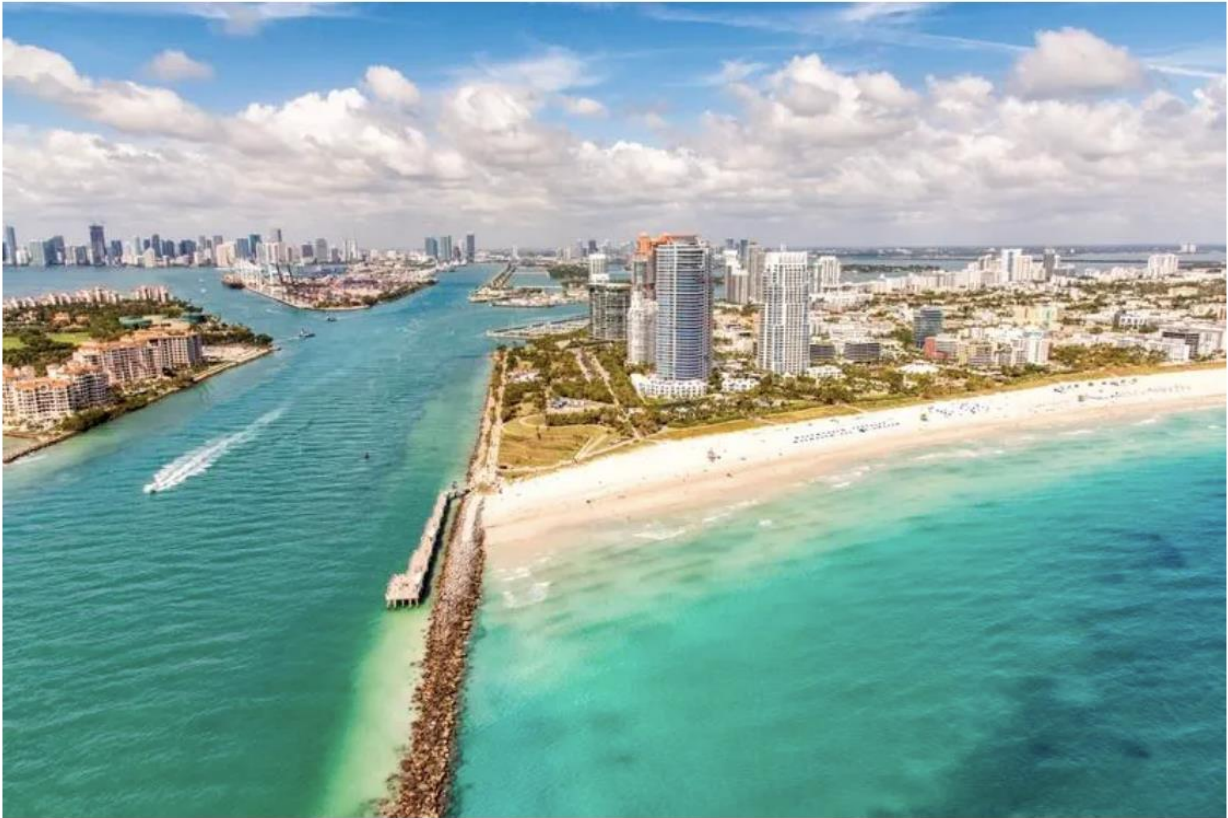
The Eichners' original Continuum South Beach, which set Miami's standard for 5-star, resort style living two decades ago

So, what does it actually mean to “own the water” in Miami if you’re a buyer?