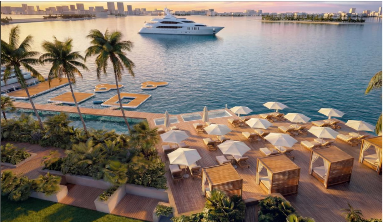
The Mermaid Club.