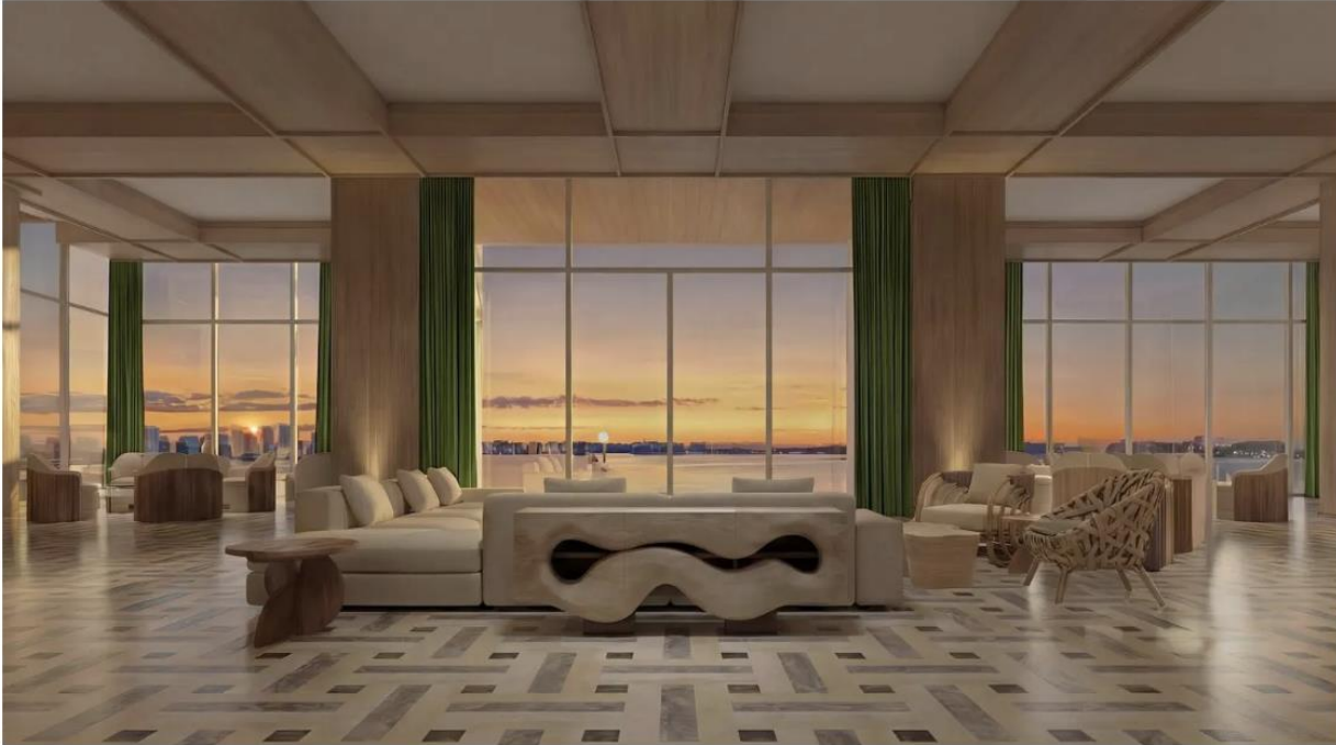
The Continuum Company brand is based on being directly on the water. Now it owns it

Step back inside Continuum 12000 and the wellness-through-movement narrative continues with a 4,200-square-foot fitness center, indoor pickleball and multi-sport courts, golf and multi-sport simulator suites, putting greens, and an owners' sports screening lounge. There's also a longevity spa with contrast rituals, infrared saunas, cold plunges, treatment rooms, and a lounge dedicated to recovery and rejuvenation.