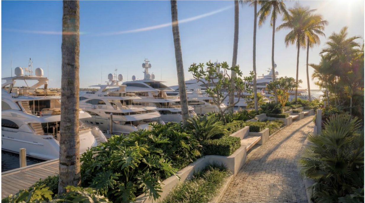
The venture will feature a 20-slip marina. Image from Continuum Cos.

Homes at The Continuum 12000 Sport & Wellness Residences will include one-bedroom to three-bedroom layout plans, measuring 1,035 to 3,543 square feet each. Sales officially launched this past week, with the cost of ownership starting at $1.4 million. The development would not allow short-term rentals under six months.