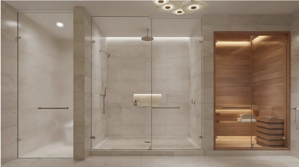
Private, en suite sauna, anyone?