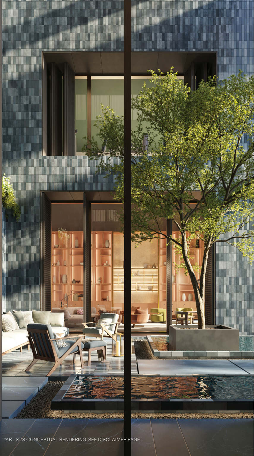
*ARTIST'S CONCEPTUAL RENDERING. SEE DISCLAIMER PAGE.