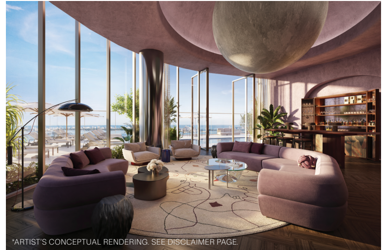
*ARTIST'S CONCEPTUAL RENDERING. SEE DISCLAIMER PAGE.