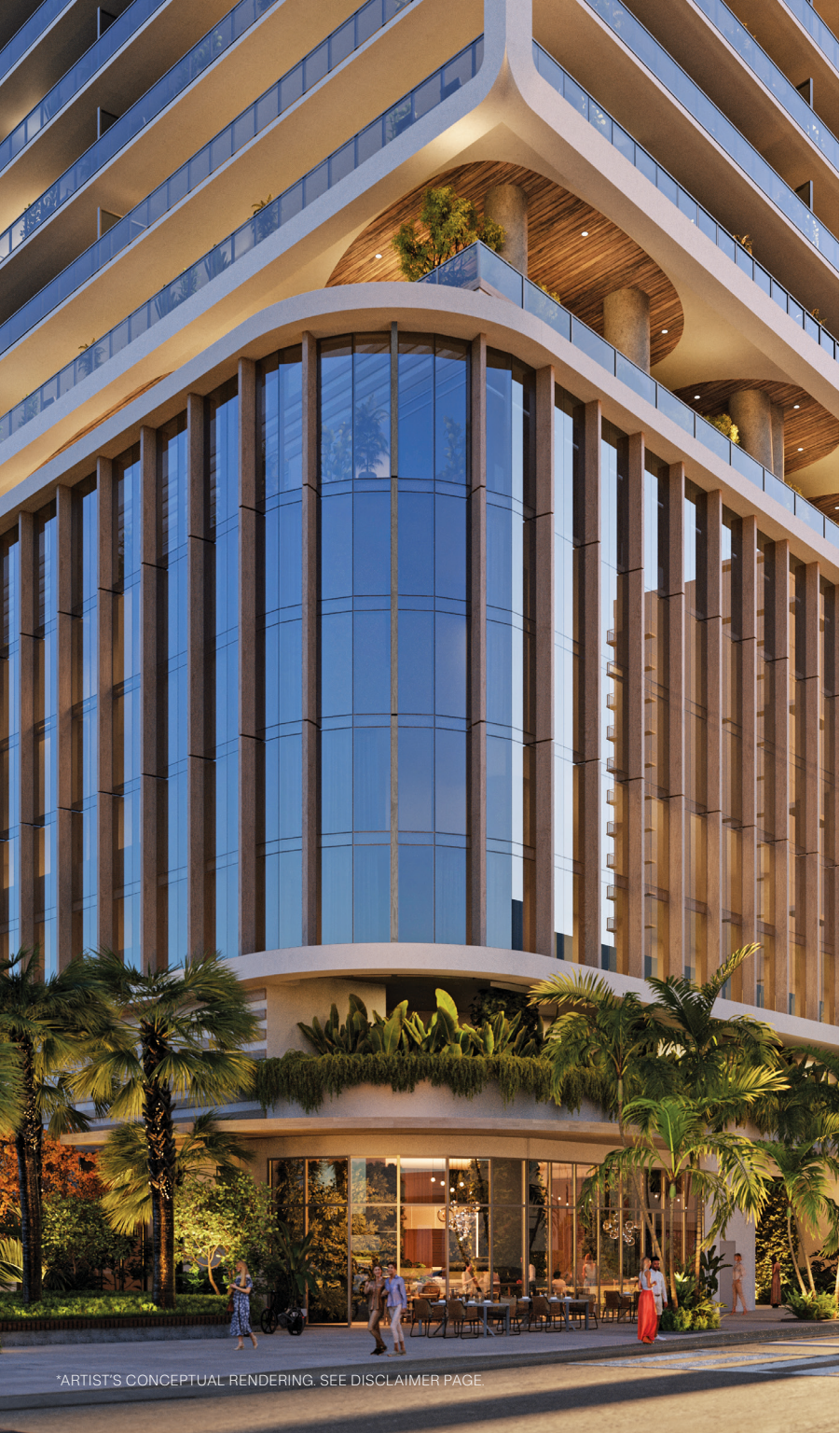
*ARTIST'S CONCEPTUAL RENDERING. SEE DISCLAIMER PAGE.