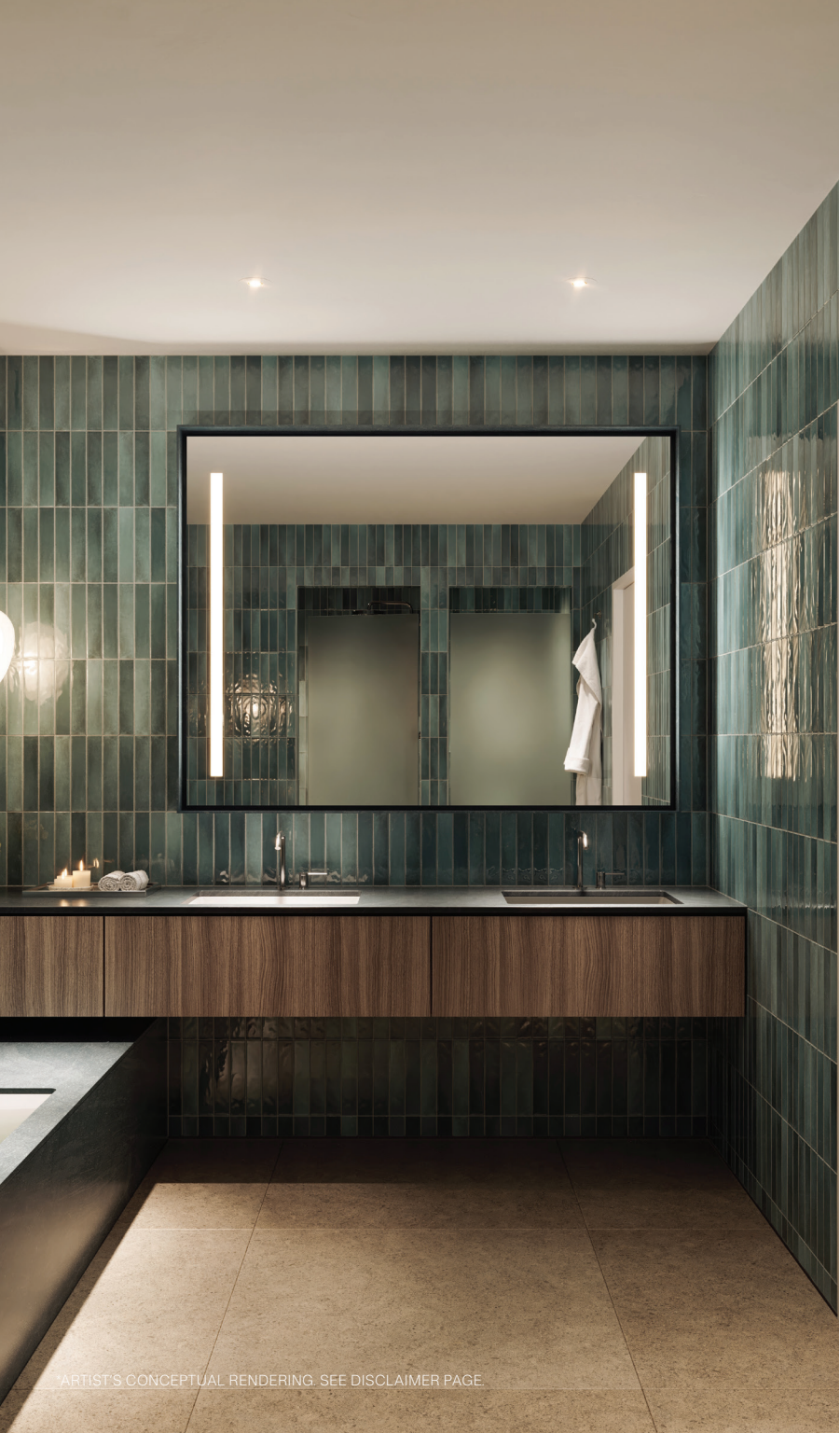
*ARTIST'S CONCEPTUAL RENDERING. SEE DISCLAIMER PAGE.