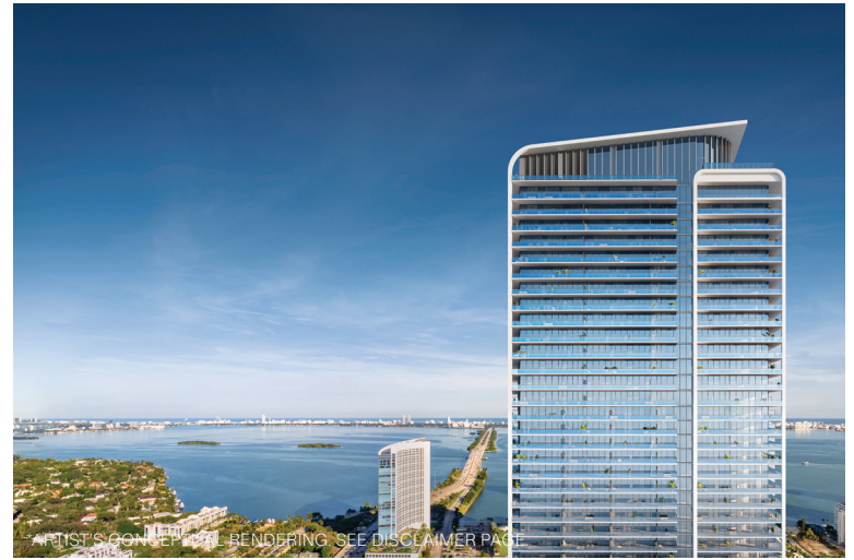
*ARTIST'S CONCEPTUAL RENDERING. SEE DISCLAIMER PAGE.