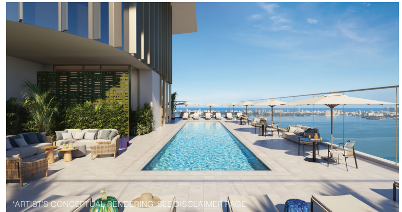
*ARTIST'S CONCEPTUAL RENDERING. SEE DISCLAIMER PAGE.