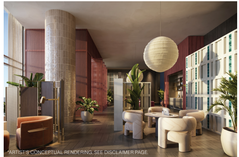
*ARTIST'S CONCEPTUAL RENDERING. SEE DISCLAIMER PAGE.