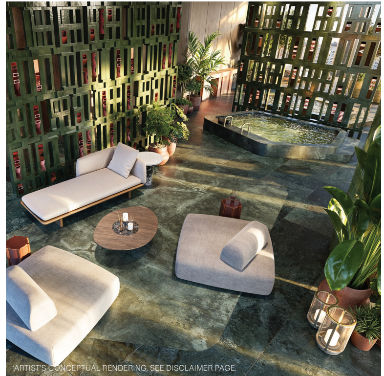
*ARTIST'S CONCEPTUAL RENDERING. SEE DISCLAIMER PAGE.