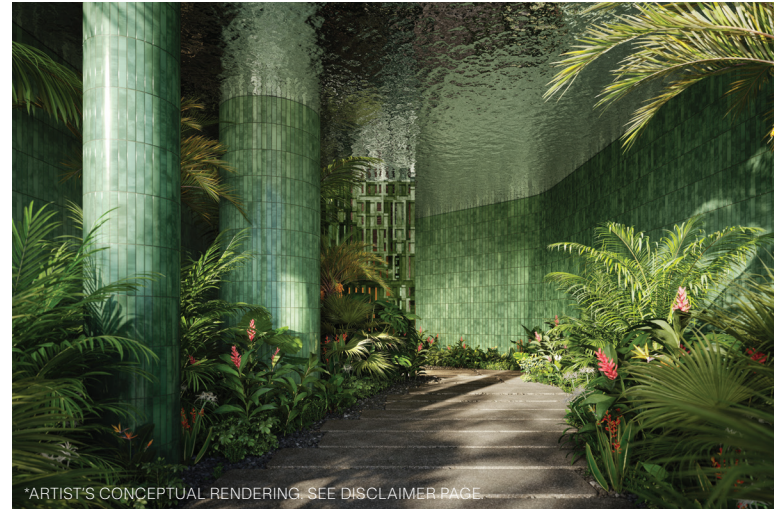
*ARTIST'S CONCEPTUAL RENDERING. SEE DISCLAIMER PAGE.