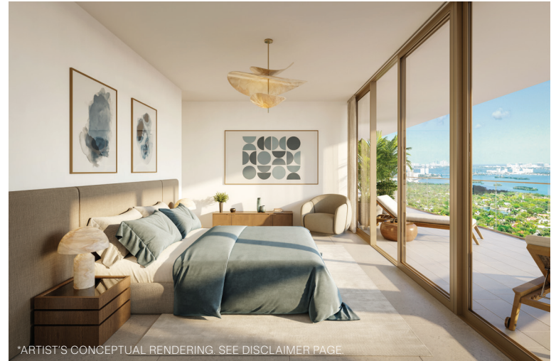
*ARTIST'S CONCEPTUAL RENDERING. SEE DISCLAIMER PAGE.