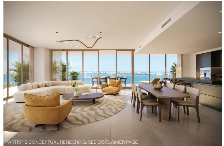
*ARTIST'S CONCEPTUAL RENDERING. SEE DISCLAIMER PAGE.