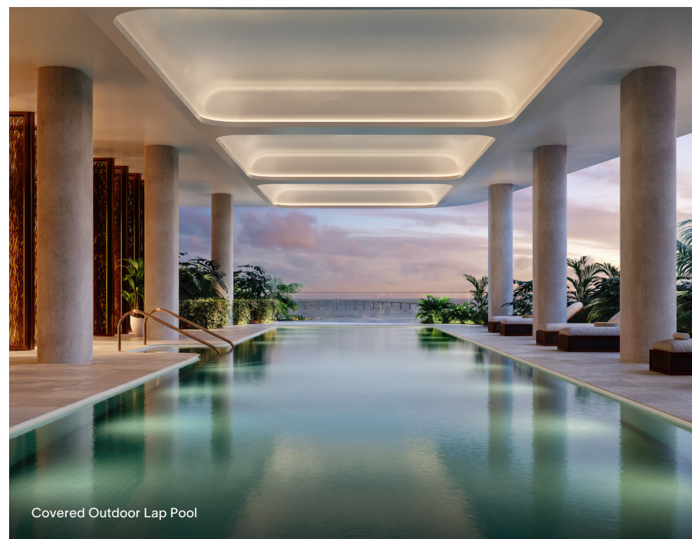
Covered Outdoor Lap Pool