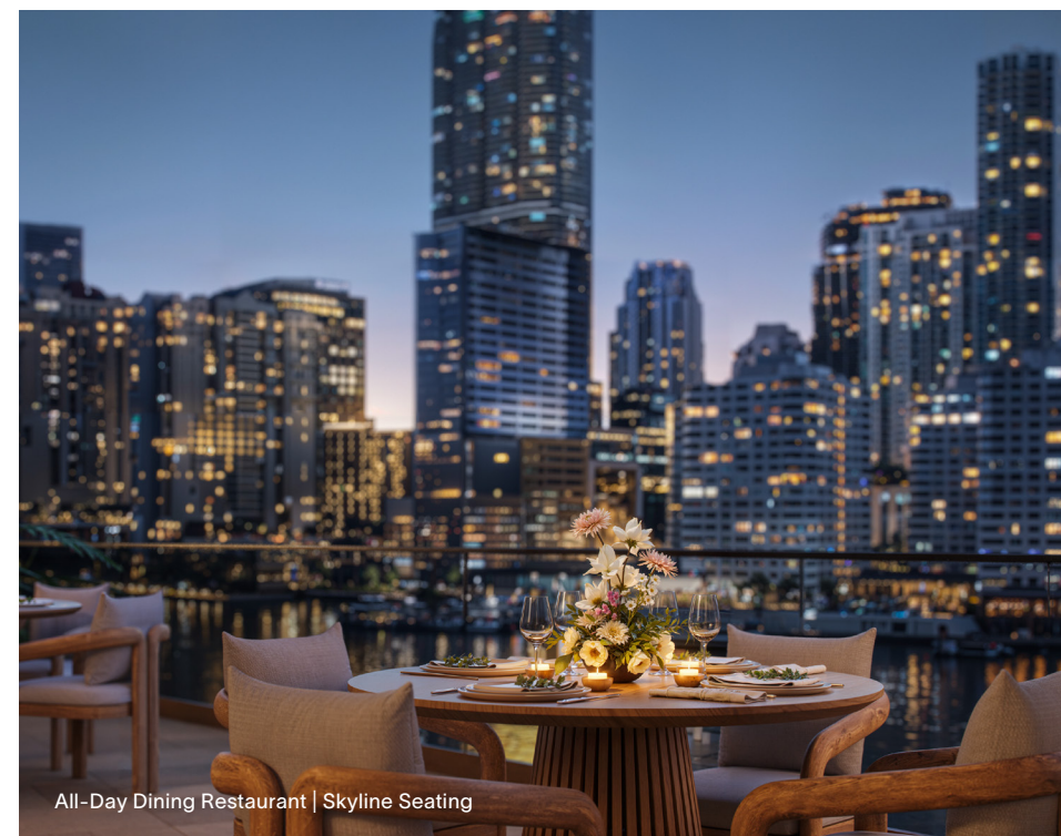
All-Day Dining Restaurant | Skyline Seating