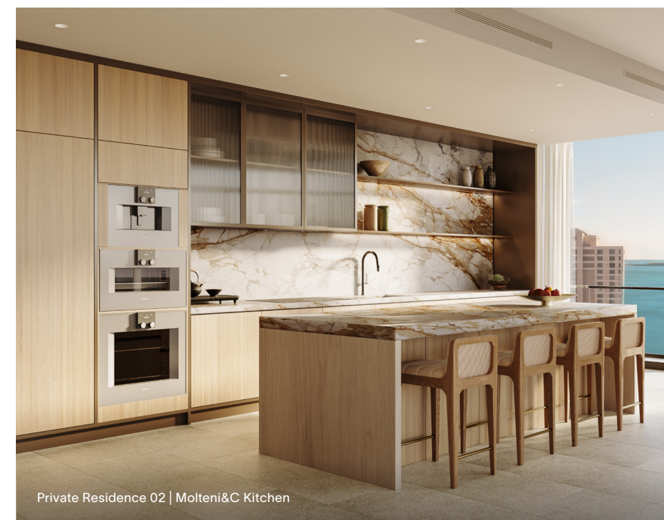
Private Residence 02 | Molteni&C Kitchen