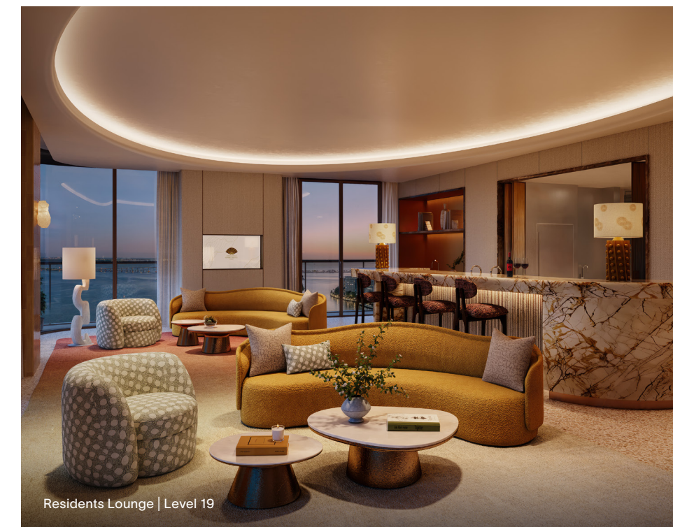
Residents Lounge | Level 19