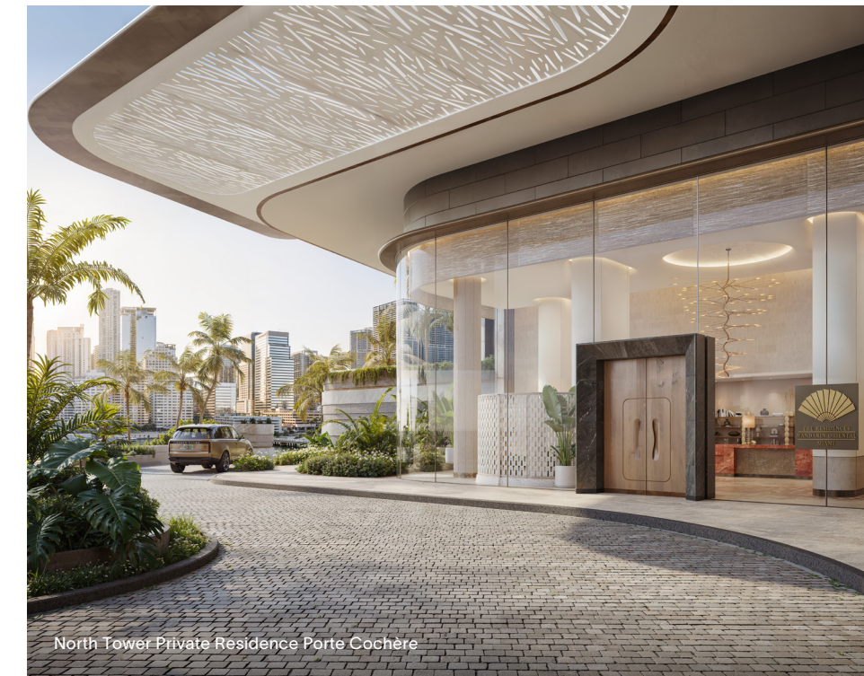
North Tower Private Residence Porte Cochère