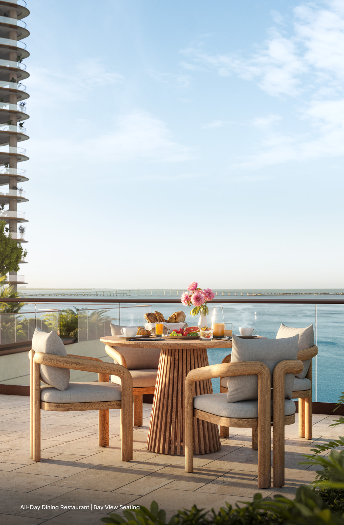
All-Day Dining Restaurant | Bay View Seating