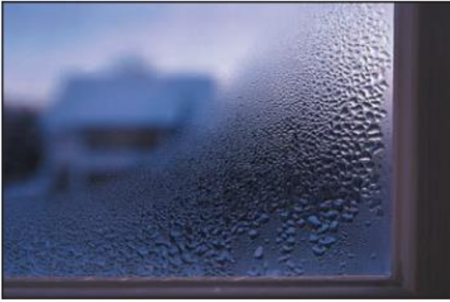
Condensation on the inside of a window-pane.